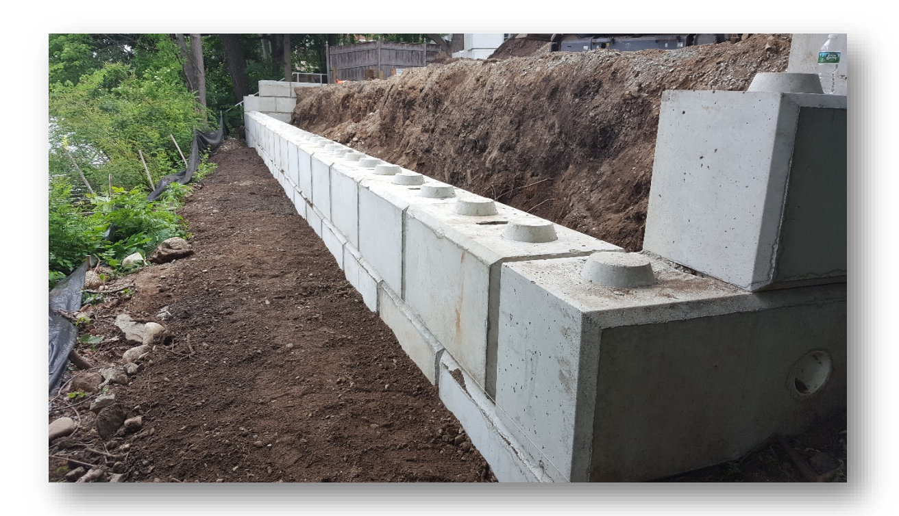
Backfilling of first block