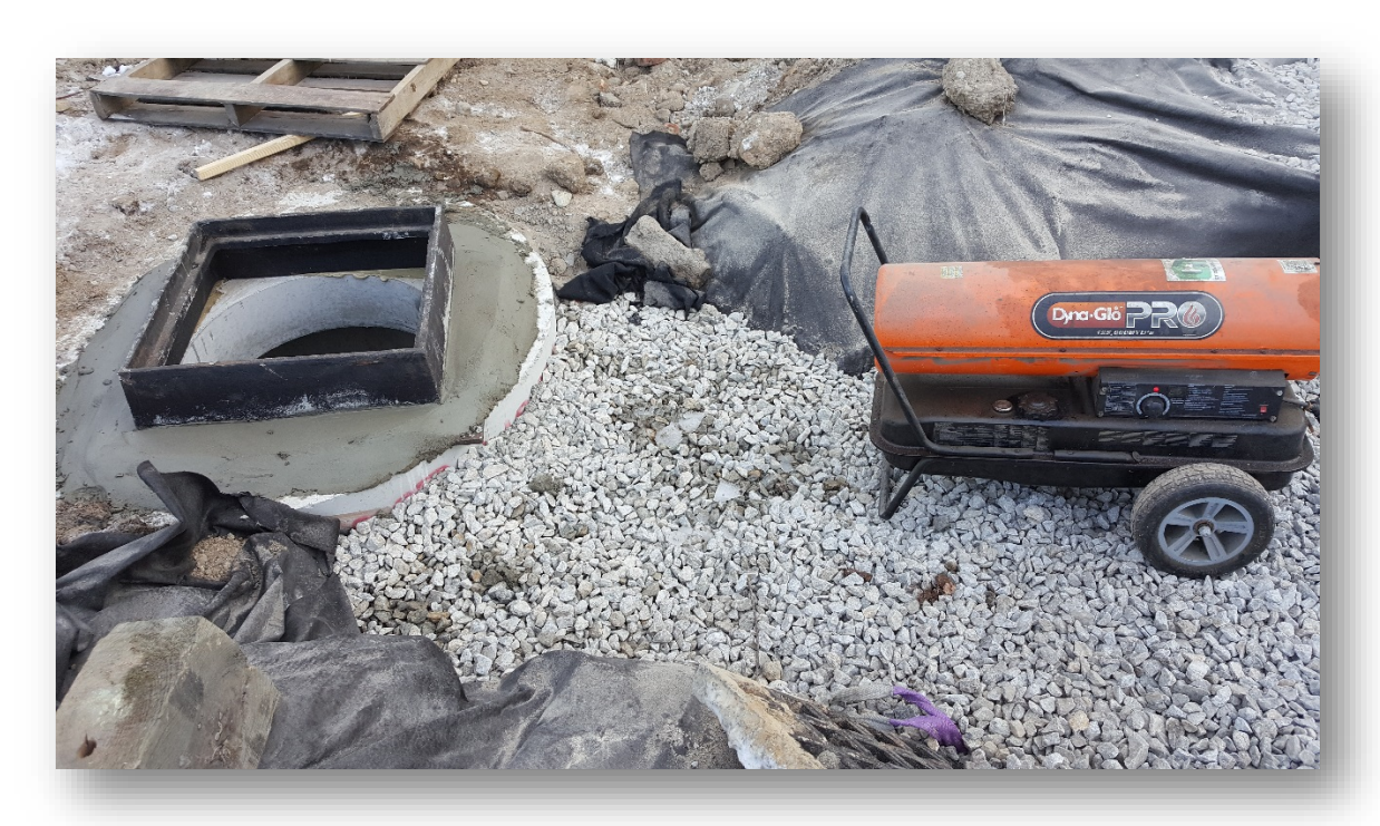
Mortaring of catch basin covers