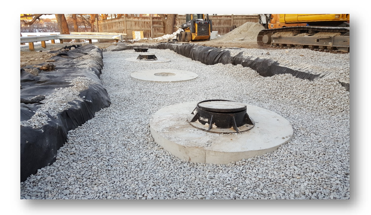
Backfill of leach pit and installation of manhole covers