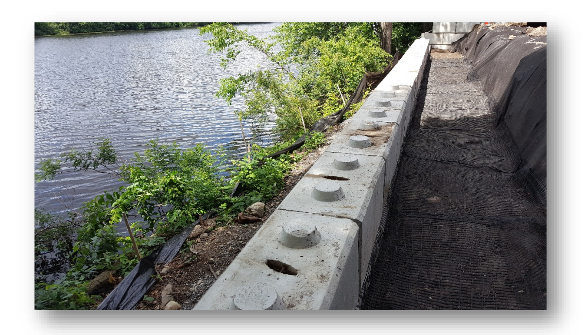
Installation of Reinforcing GeoGrid