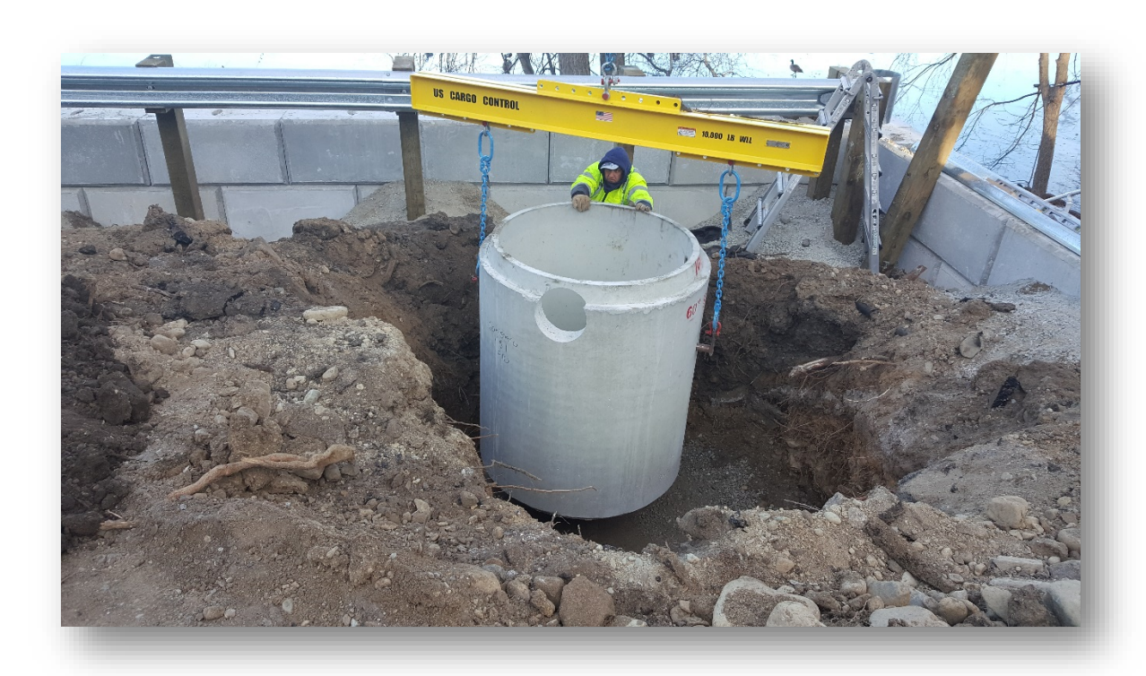
Installation of precast catch basin manholes