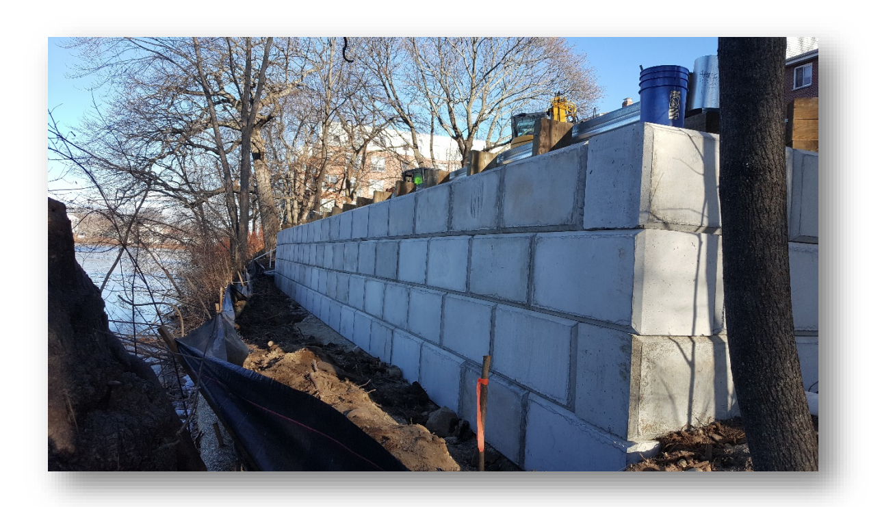
Completed Retaining Wall