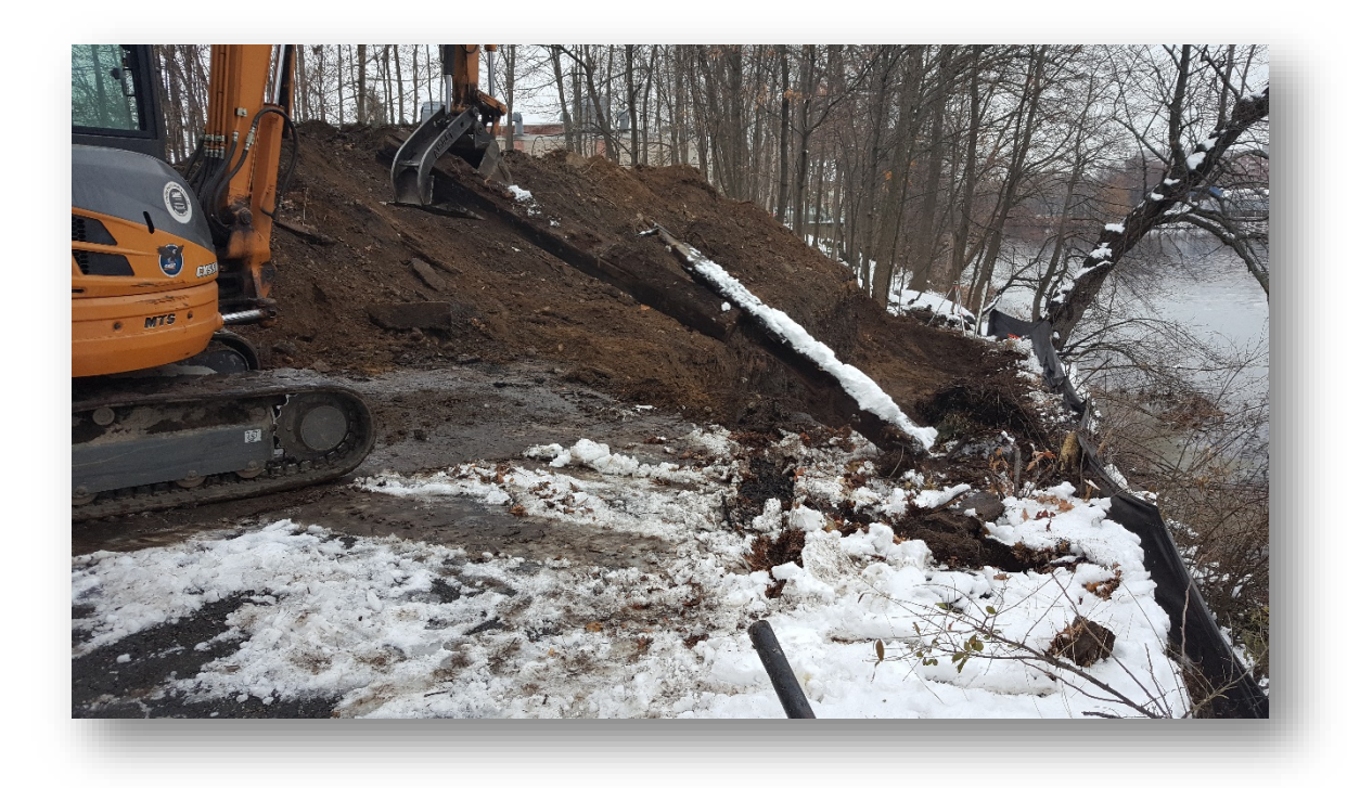
Demolition of failing creosote timber wall within two feet of the river