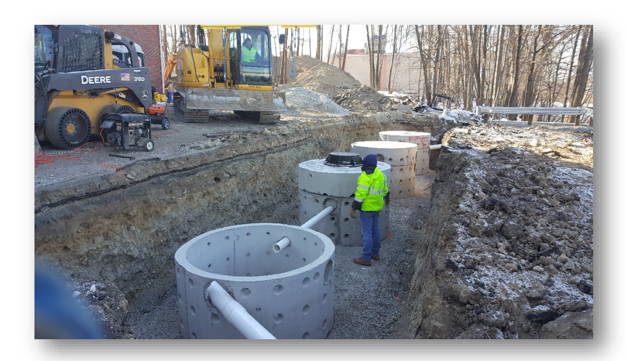
Installation of below grade connecting piping