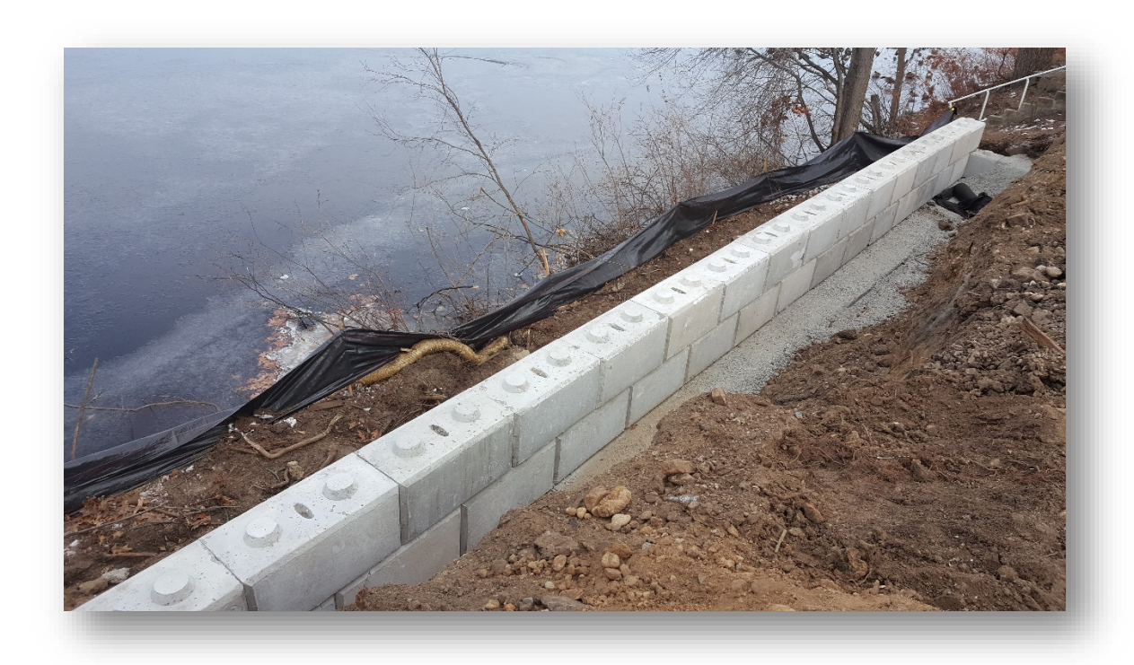
Installation of new retaining wall base blocks using Conigliaro Blocks