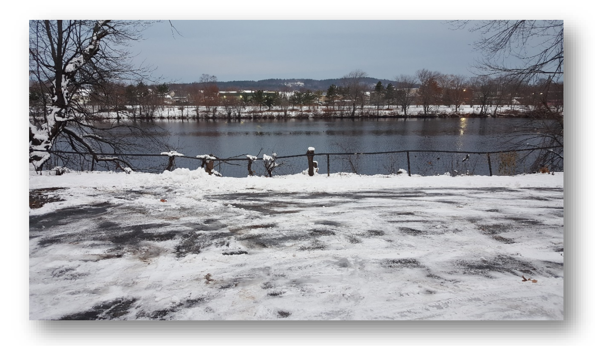
Before – a failing retaining wall and sinking parking lot just feet away from the Charles River

A complex site on the Charles River in Waltham, MA. The project involved permitting with several city and state regulators and included installing a new retaining wall, drainage structures and a guard rail.