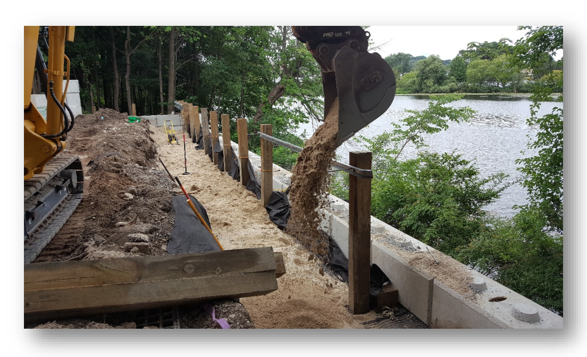
Installation of Guard Rail System