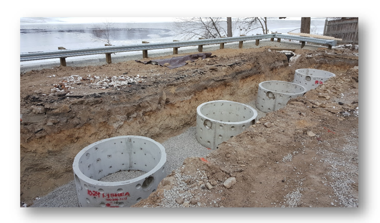
Installation of precast leach pits