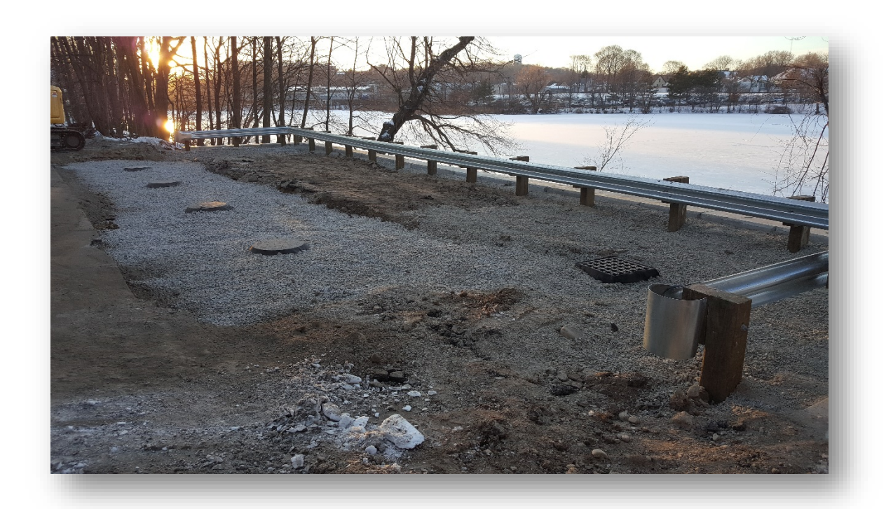
Completed site awaiting final grading and pavement