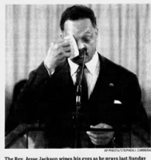
The Rev. Jesse Jackson wipes his eyes as he prays last Sunday during a Baptist church service in Chicago.