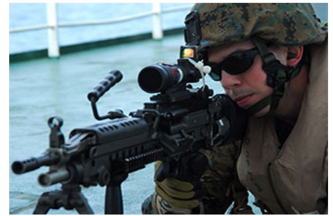
Force Recon Marine armed with M249 SAW machine gun (click image for fullsize view & more info) more US Special Ops photos