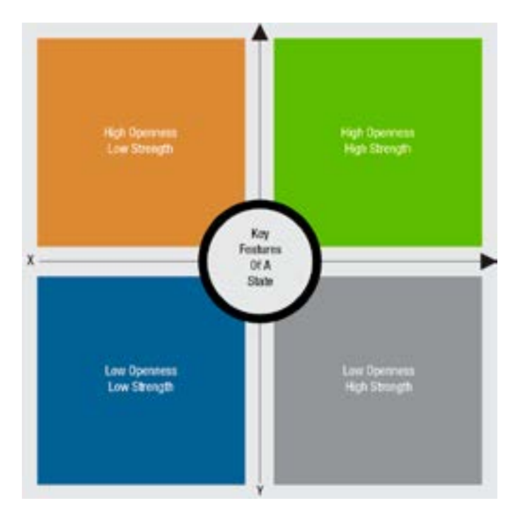
Figure 3. Quadrant graph of key features of a state.

Figure 3 depicts a quadrant graph of key features of a state that impact the trajectory of a resistance movement: state strength versus state weakness and state openness versus state closedness.