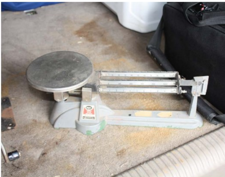
Scale FREE 916-759-6416