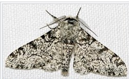
Biston betularia f. typica , the white-bodied peppered moth.

The peppered moth has a broad, furry body and long, narrow wings that it holds straight out to the side. It is usually whitish with intricate black markings all over, but some individuals are entirely sooty black (melanic forms). The similar oak beauty has two brownish bands on the wings, and holds its wings further back.