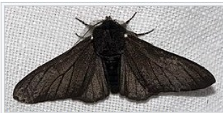
Biston betularia f. carbonaria , the black-bodied peppered moth.