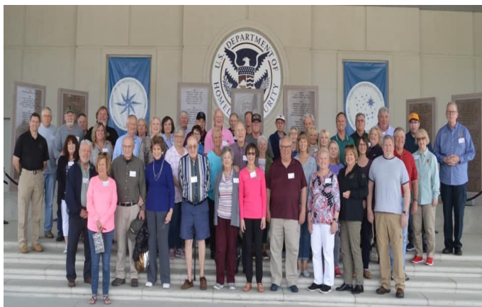
ATFAR Members at the FLETC Welcome Center