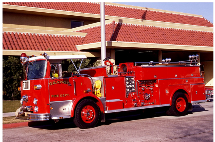
A Crown Pumper from Orange, CA