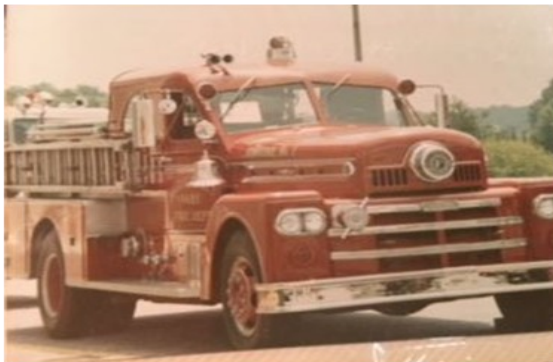
My 1959 Seagrave Pumper