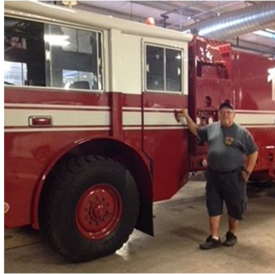
A U.S. Air Force Crash Truck