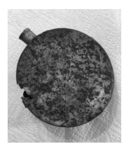
This is the canteen after elecrolysis and pariffin.

One of our best finds yet. This is a confederate canteen. I dug this at the location of a skirmish in which the carrier of the canteen may not have fared too well. The hole in the side of the canteen matches up exactly to a .58 caliber Minnie ball. Also found were several other impacted bullets and a pocket knife. I cleaned the canteen via electrolysis and sealed it with paraffin.