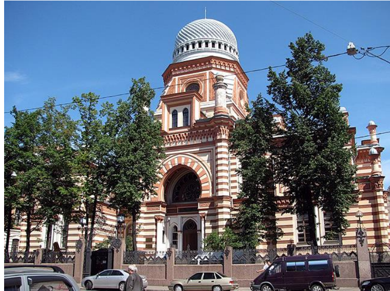
St. Petersburg, Russia