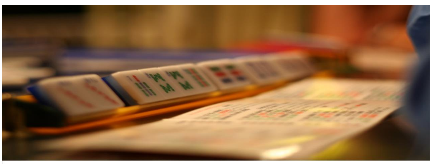
N.O.W. (Network Of Women)

It's that time of year! We are selling 2021 Mah Jongg cards to support N.O.W. and our temple.