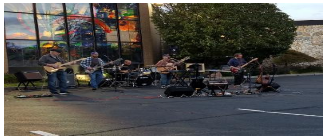
Featuring The Vinyl Frontier