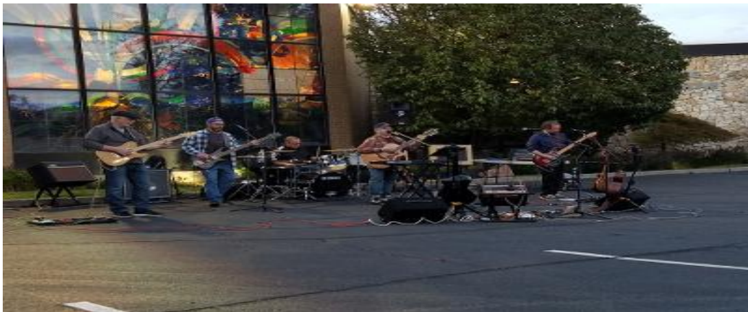
Featuring The Vinyl Frontier