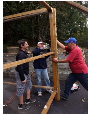
Building Our Sukkah