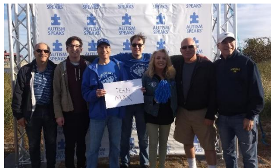
Autism Awareness Walk

In honor of our new Temple Or Elohim, A Community Reform Congregation (TOE,ACRC), let us look at our Jewish community on Long Island and beyond. We are all connected under an important uniting factor, our desire to have the best life for ourselves, others and our posterity. So, while celebrating the merger and the new year let us join together, B'Yachad, to make a difference. Volunteer, do a mitzvah or just come to services more regularly. If every one of us contributes time and/or money we will be stronger than ever. Join us in our continuing effort to make Long Island and the world a better place