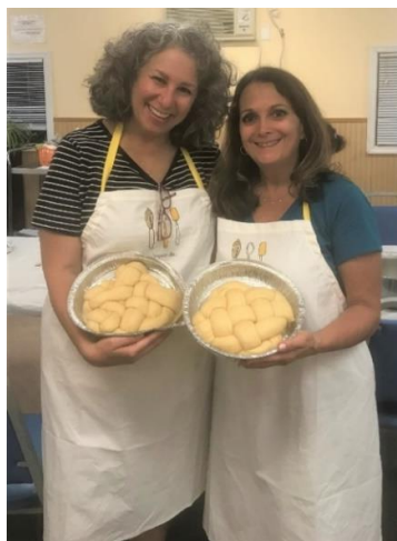
NOW's challah baking