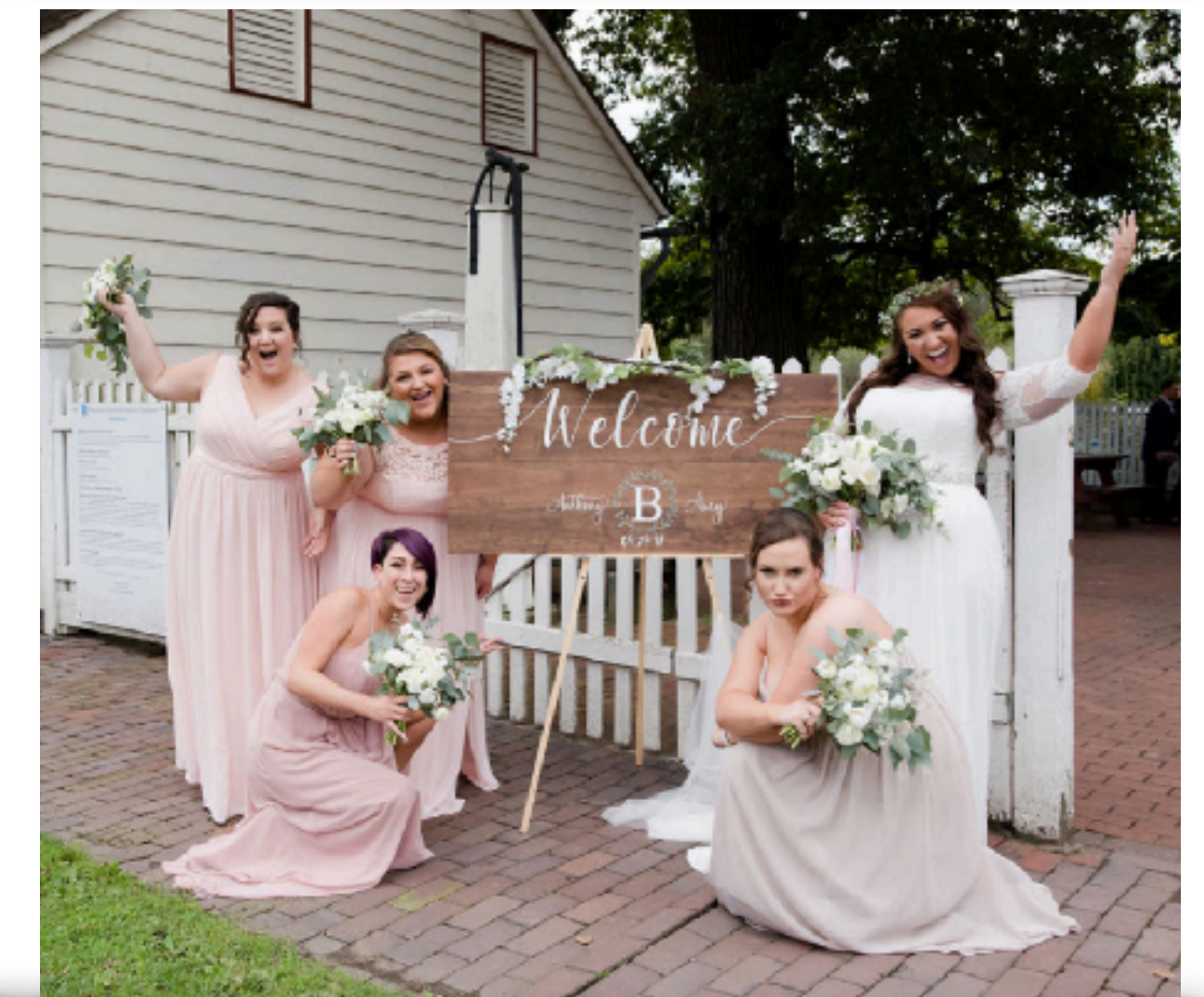
"Late Summer Garden" design at Old Economy Village