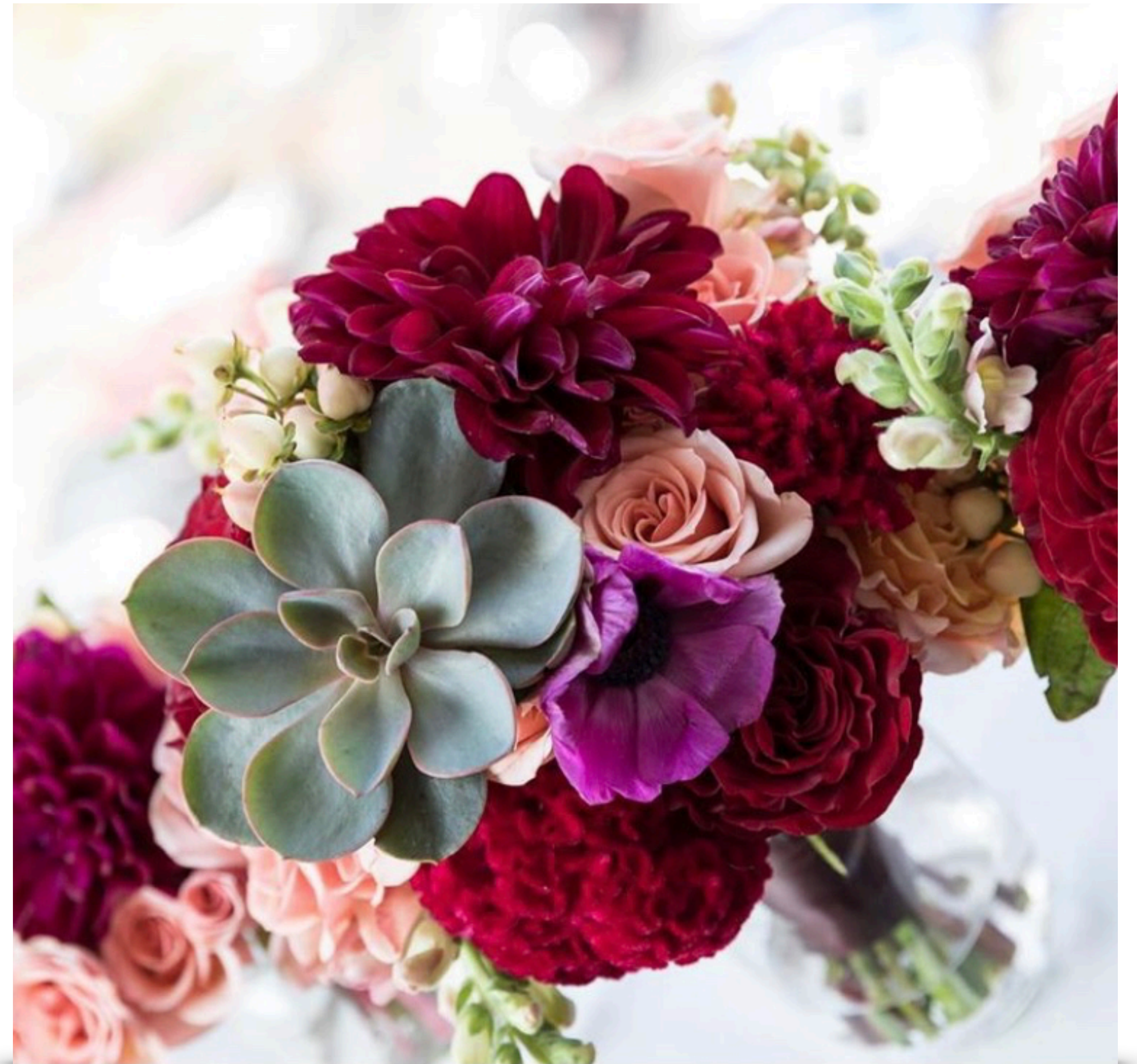
"Cranberry Coral" design at Pittsburgh Zoo + PPG Aquarium