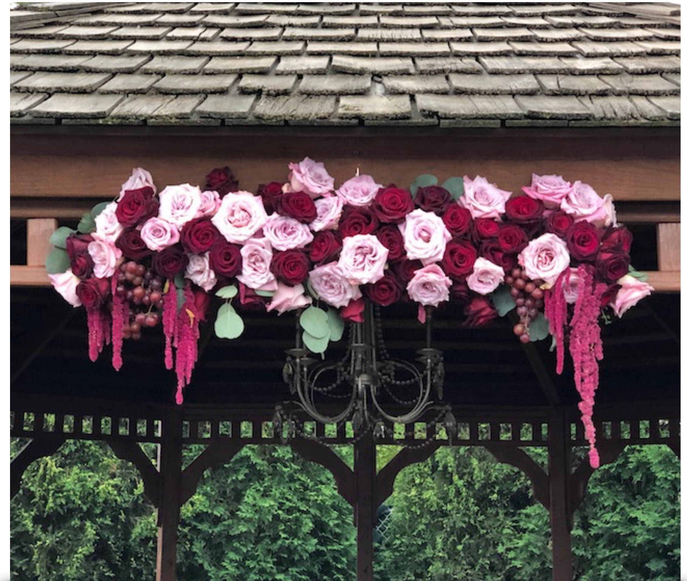
Laura + Daniel's "Garden Wine" design at The Atrium