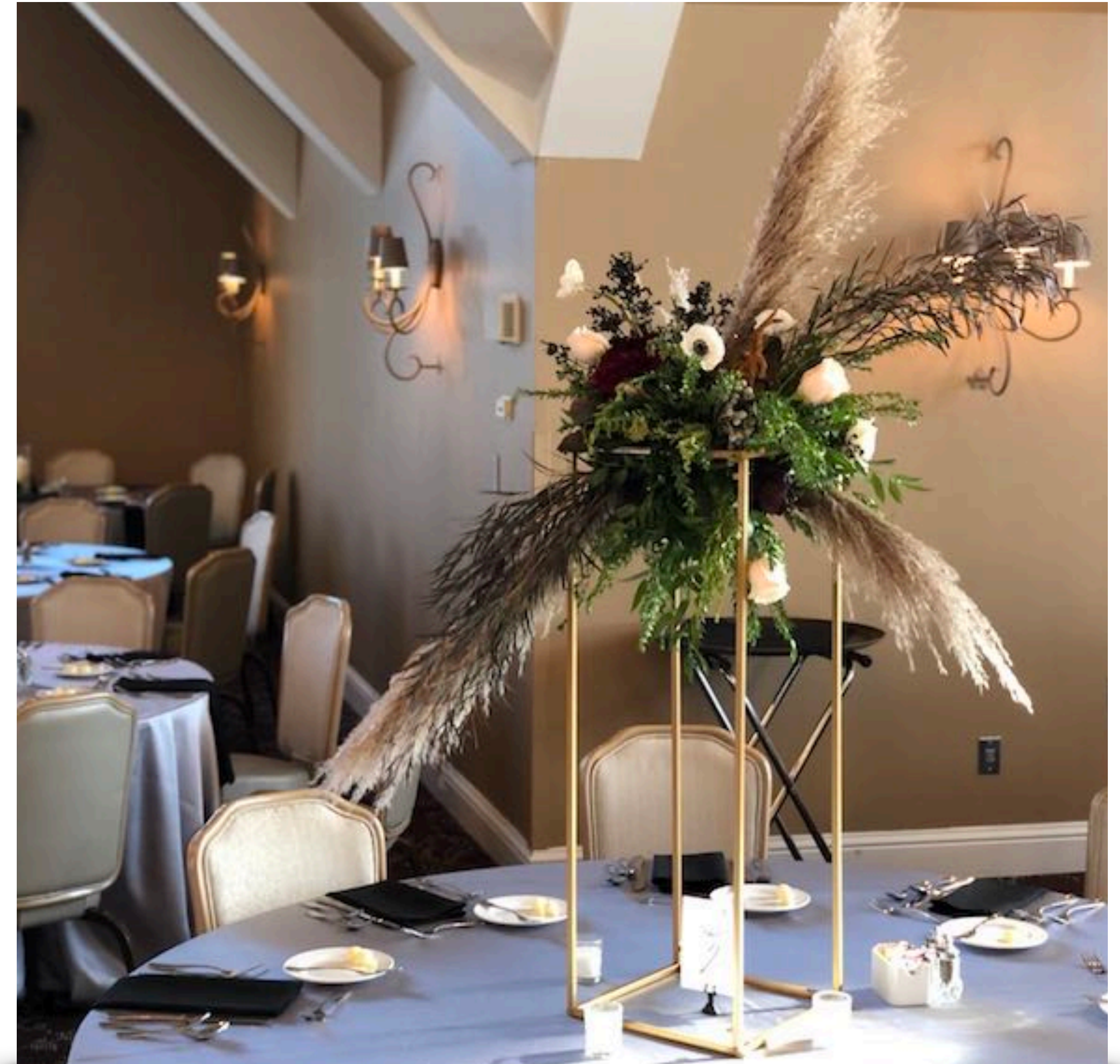
"Natural Asymmetry" design at Nevillewood Country Club