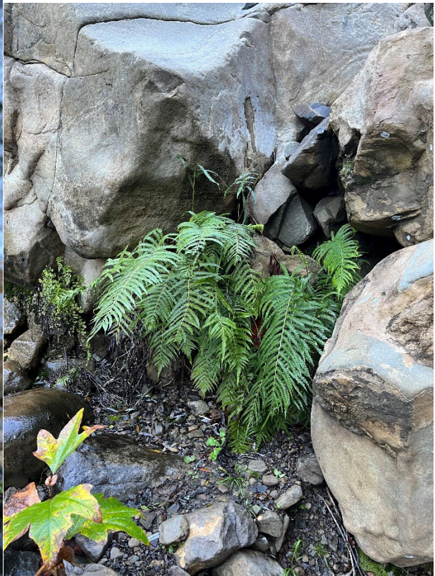
Sonoran maiden fern, Thelypteris puberula var sonorensis