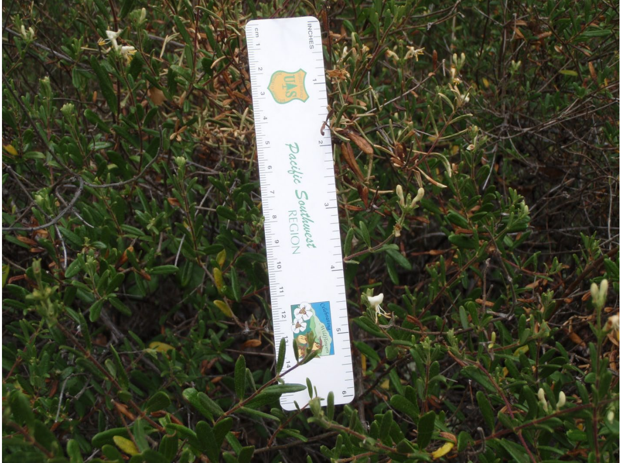
Santa Barbara honeysuckle, Lonicera subspicata var. subspicata