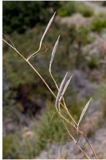
Late-flowering mariposa lily,