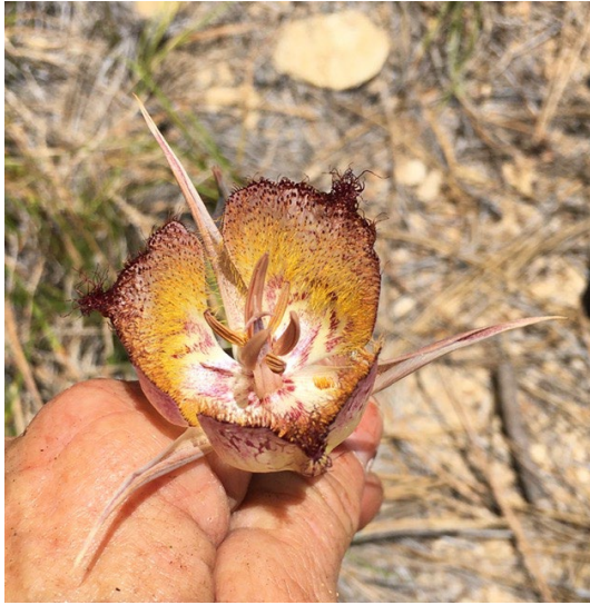
Late-flowering mariposa lily,