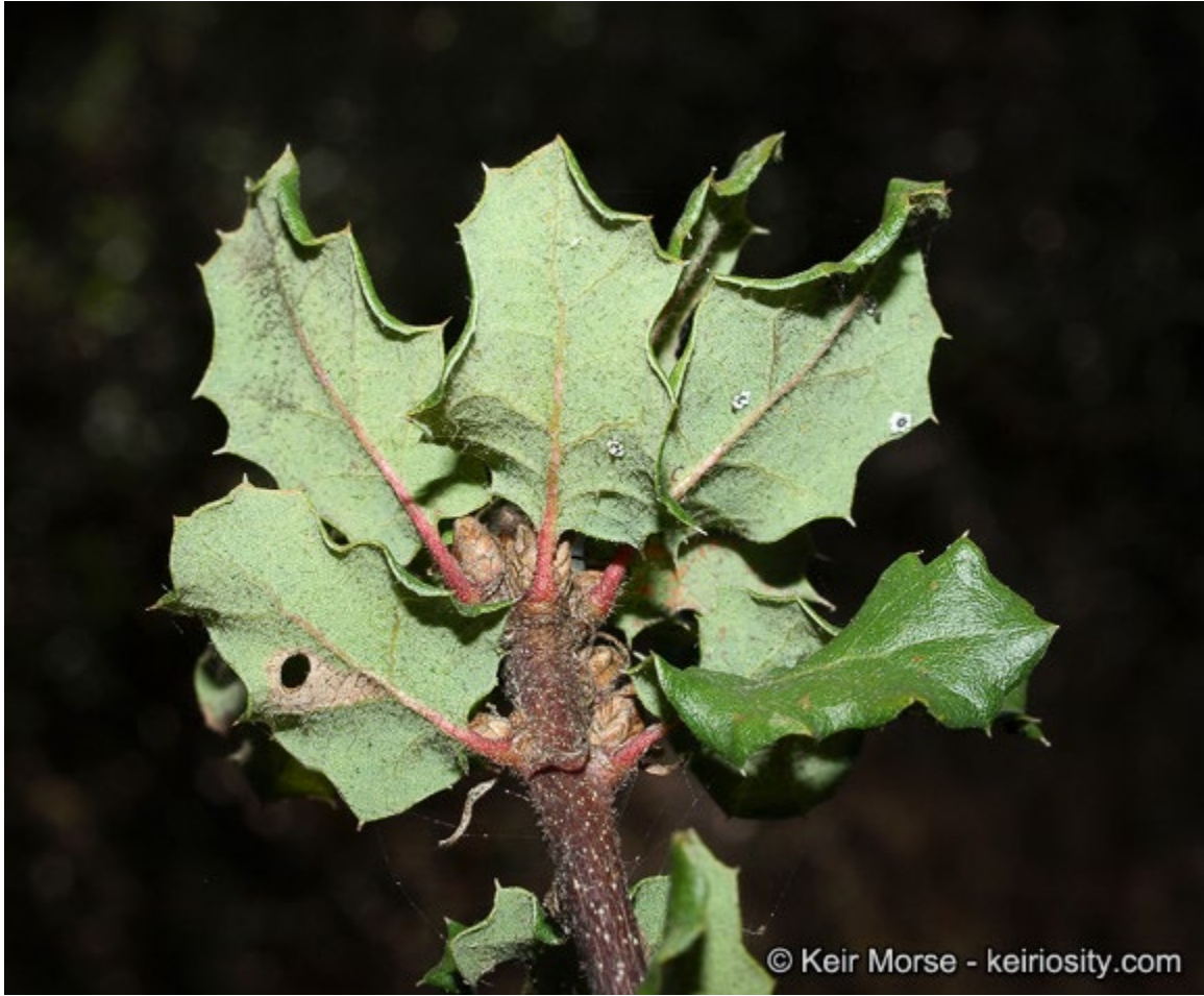
Quercus dumosa , Nuttall's scrub oak