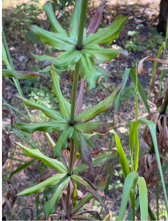
Humboldt's lily, Lilium humboldtii

Not sensitive but please don't cut down when green. Present along a number of trails within shady areas. Easy to identify from by the whorled leaves.