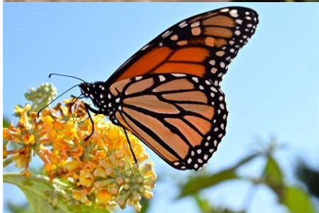
Monarch caterpillar ( Danaus plexippus ) chrysalis and butterfly. Status: candidate for federal listing under the Endangered Species Act. Avoid disturbance to milkweed prior to dormancy.