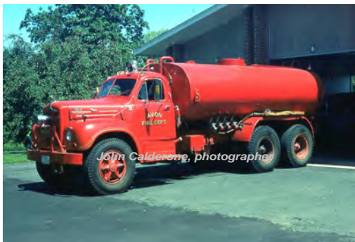
photo needed Eng 4 Avon Vol. Fire Dept. 1962-1981 COMPILED BY CONNECTICUT FIREMEN'S HISTORICAL SOCIETY, MANCHESTER, CT

1959 Dept. Built Mack tanker 3500 gal tank