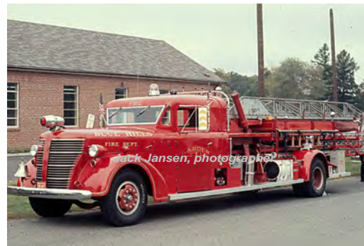
Reg #L-2403 ship 11-29-1946 M-190 (manual jacks). 600 series based on wider fillet betw grille and front fender.

COMPILED BY CONNECTICUT FIREMEN'S HISTORICAL SOCIETY, MANCHESTER, CT