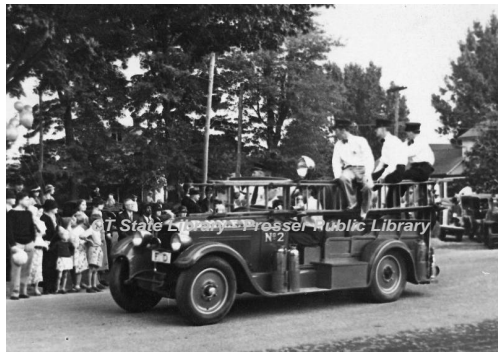
1935 parade, on Sept. 21