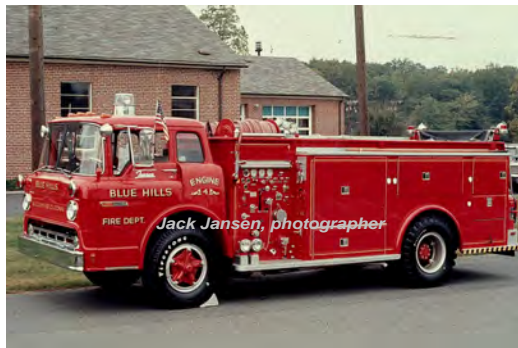
Was the BH's first E4? Not sure of date to SW.

COMPILED BY CONNECTICUT FIREMEN'S HISTORICAL SOCIETY, MANCHESTER, CT