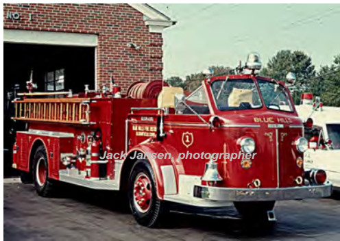
Ship 9-24-57 D-810-PKO. Group photo as E4 w/canopy, high wipers.

Eng 1, 4 Blue Hills Fire Dept., Bloomfield 1957-1985