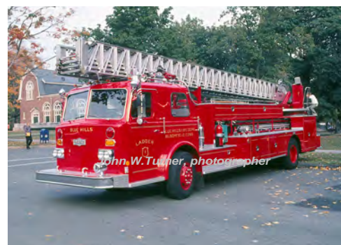
ARN says 1972, delivered 4-1973

COMPILED BY CONNECTICUT FIREMEN'S HISTORICAL SOCIETY, MANCHESTER, CT