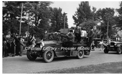
1935 parade, on Sep 21

COMPILED BY CONNECTICUT FIREMEN'S HISTORICAL SOCIETY, MANCHESTER, CT