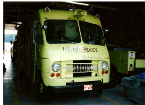
Or a '68

COMPILED BY CONNECTICUT FIREMEN'S HISTORICAL SOCIETY, MANCHESTER, CT