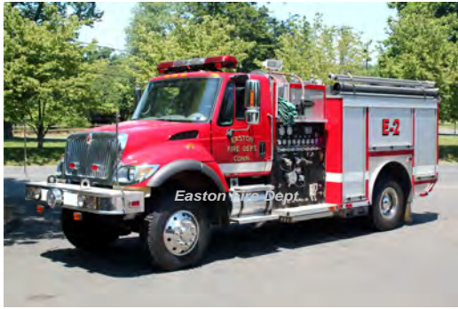
Easton Fire Dept.