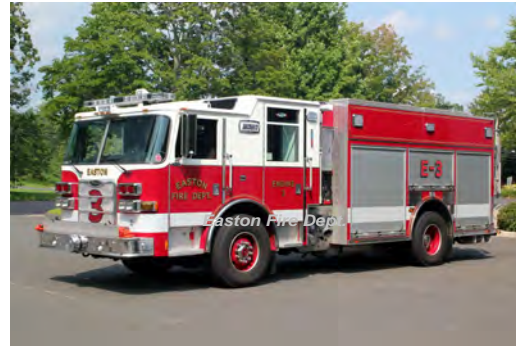
Easton Fire Dept.

COMPILED BY CONNECTICUT FIREMEN'S HISTORICAL SOCIETY, MANCHESTER, CT