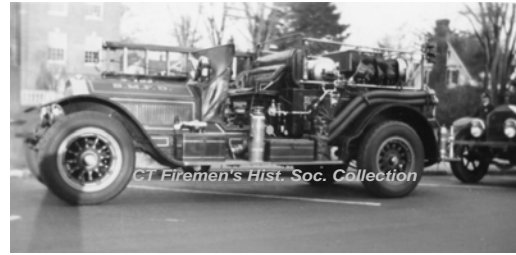
CT Firemen's Hist. Soc. Collection

COMPILED BY CONNECTICUT FIREMEN'S HISTORICAL SOCIETY, MANCHESTER, CT