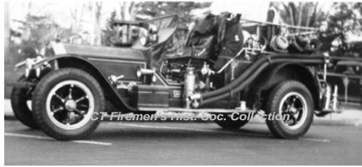
CT Firemen's Hist. Soc. Collection

1918 American LaFrance Brockway pumper, tank, hose wagon 400 gpm