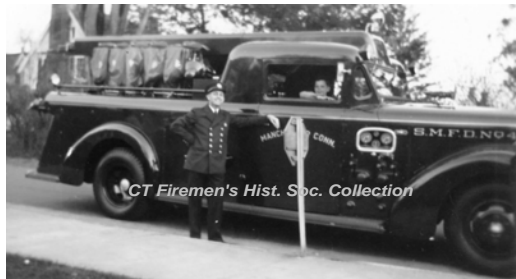
CT Firemen's Hist. Soc. Collection

COMPILED BY CONNECTICUT FIREMEN'S HISTORICAL SOCIETY, MANCHESTER, CT