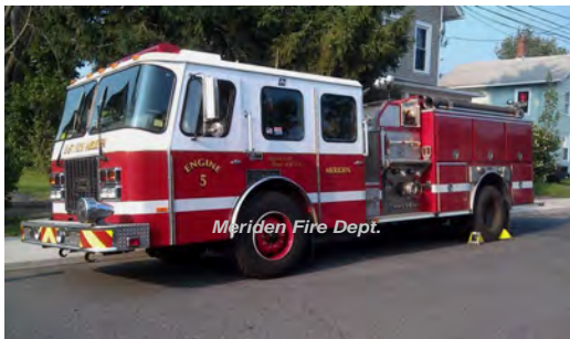
Meriden Fire Dept.

COMPILED BY CONNECTICUT FIREMEN'S HISTORICAL SOCIETY, MANCHESTER, CT