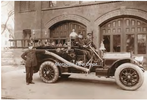
Meriden Fire Dept.