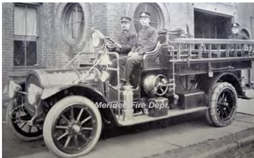
Meriden Fire Dept.

COMPILED BY CONNECTICUT FIREMEN'S HISTORICAL SOCIETY, MANCHESTER, CT