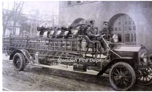
Meriden Fire Dept.

COMPILED BY CONNECTICUT FIREMEN'S HISTORICAL SOCIETY, MANCHESTER, CT