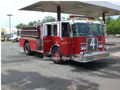
Meriden Fire Dept.

COMPILED BY CONNECTICUT FIREMEN'S HISTORICAL SOCIETY, MANCHESTER, CT