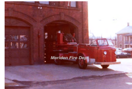
Meriden Fire Dept.

1955 American LaFrance 700 Series pumper 750 gpm 500 gal tank