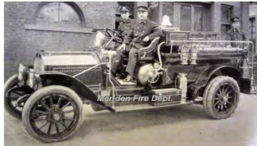
Meriden Fire Dept.

COMPILED BY CONNECTICUT FIREMEN'S HISTORICAL SOCIETY, MANCHESTER, CT