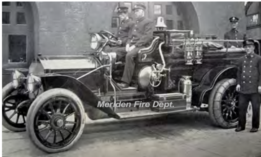
Meriden Fire Dept.

COMPILED BY CONNECTICUT FIREMEN'S HISTORICAL SOCIETY, MANCHESTER, CT