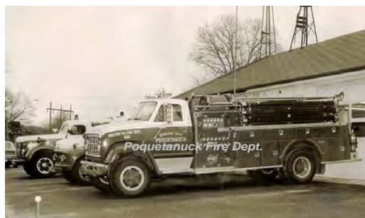
Poquetanuck Fire Dept.

COMPILED BY CONNECTICUT FIREMEN'S HISTORICAL SOCIETY, MANCHESTER, CT