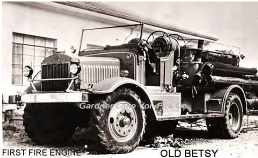
FIRST FIRE ENGINE OLD BETSY

likely a 750 gpm - other records have that. http://www.firetrucks-atwar.com/G.html