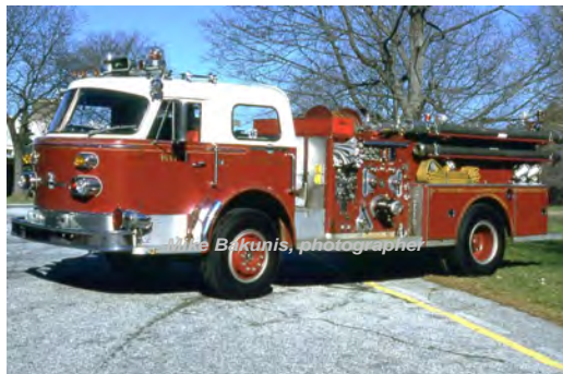
E3 closed in 1977 or 1978 (WFD)

COMPILED BY CONNECTICUT FIREMEN'S HISTORICAL SOCIETY, MANCHESTER, CT