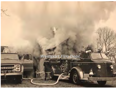
Reg #L-5425 ship 8-17-1956 775-PJO