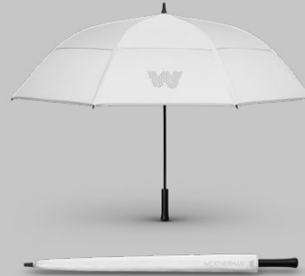
The Golf Lite