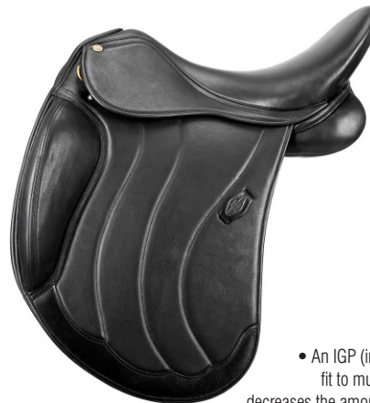
HDR Parisian Monoflap Dressage Saddle 24197 Sizes: 16.5, 17, 17.5, 21 Black $1,195