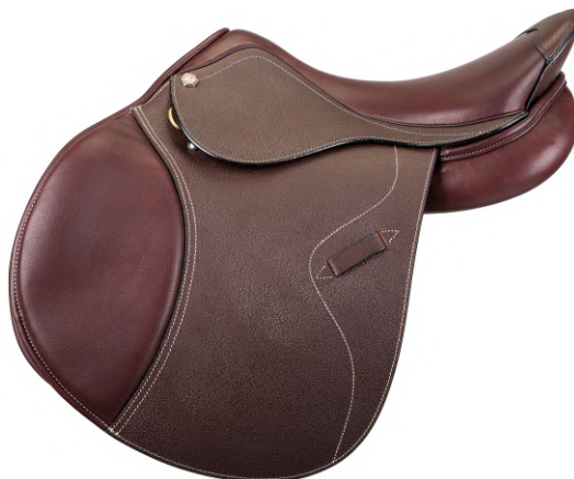
HDR Club Close Contact Plus Saddle 24198 Sizes: 14, 15, 15 3/4, 16.6 Australian Nut $850