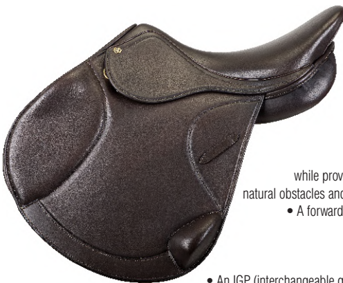
HDR Phoenix Close Contact Saddle 24196 Sizes: 16.5, 17, 17.5, 20 Havana $1,195