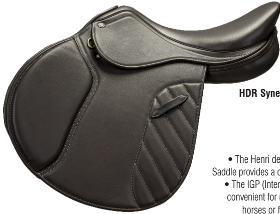
HDR Synergy Close Contact Saddle 24193 Sizes: 16.5, 17, 17.5, 18 Havana $1,195

In just 5 easy steps, you can have the options of 5 different saddles with the purchase of 1!