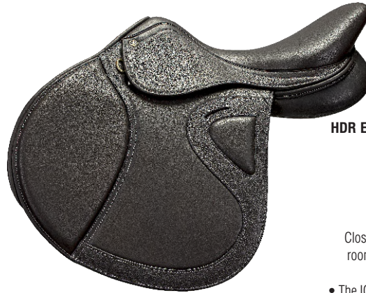
HDR Evolution Close Contact Saddle 24194 Sizes: 16.5, 17, 17.5, 19 Havana $1,195