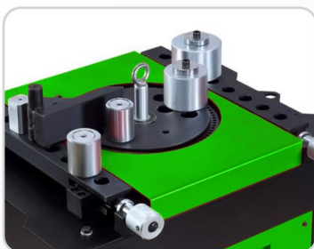
Checking Block & Bushes Helps achieve accurate bends