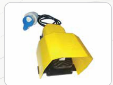
Foot Pedal Control Switch Single Person can operate easily