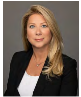
Chapter Six President