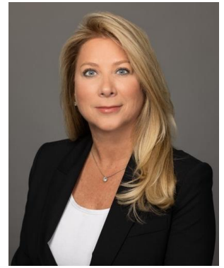
Chapter Six President