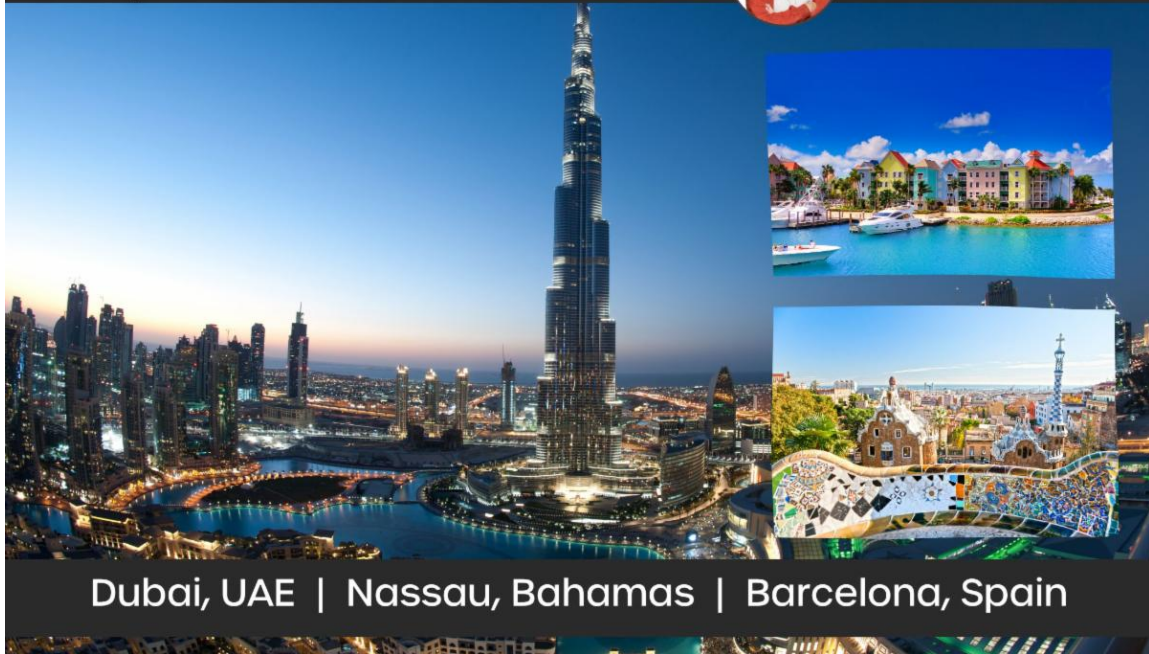
Dubai, UAE | Nassau, Bahamas | Barcelona, Spain