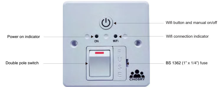
Figure 2: Functions