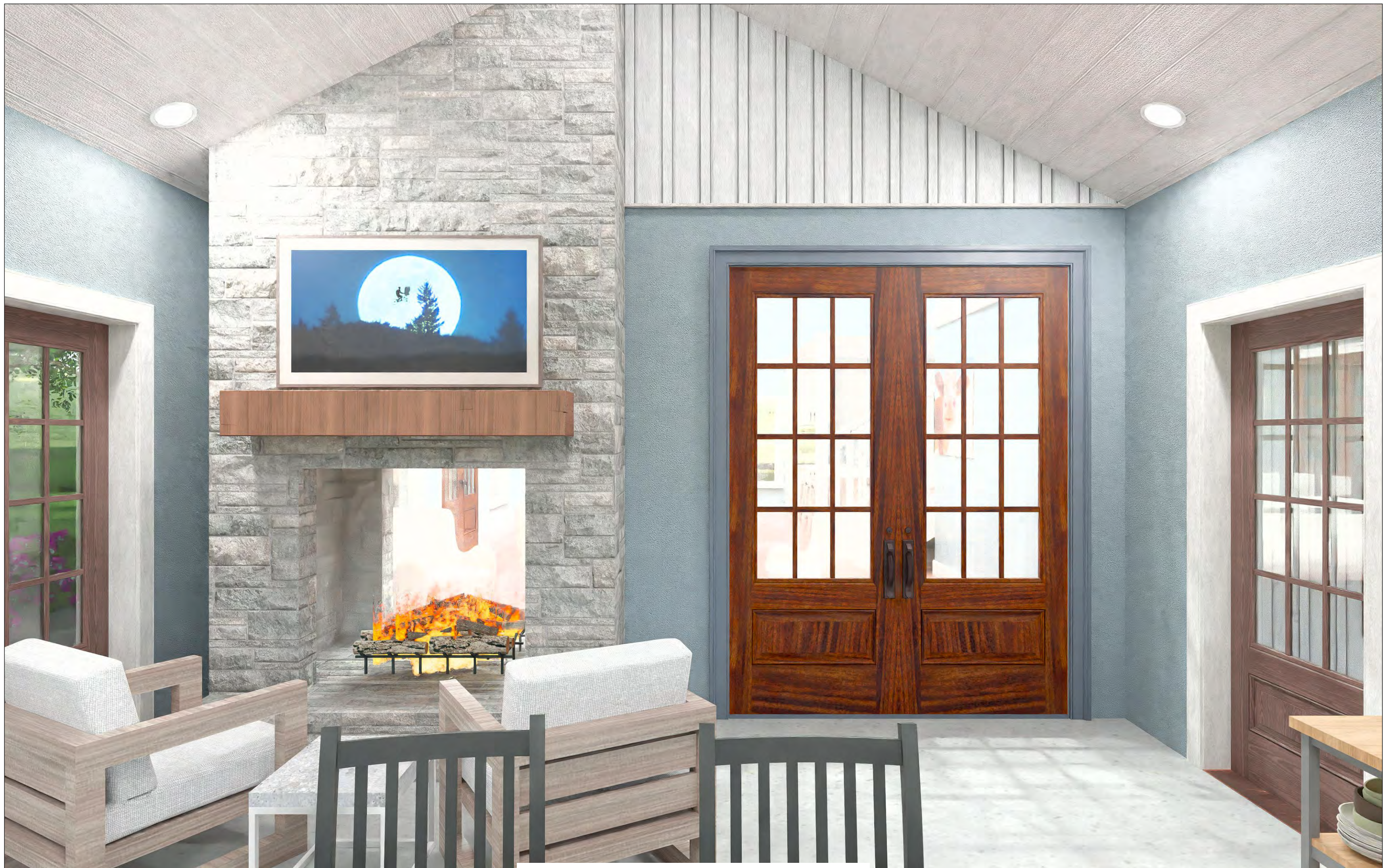
SUNROOM GARAGE DOOR