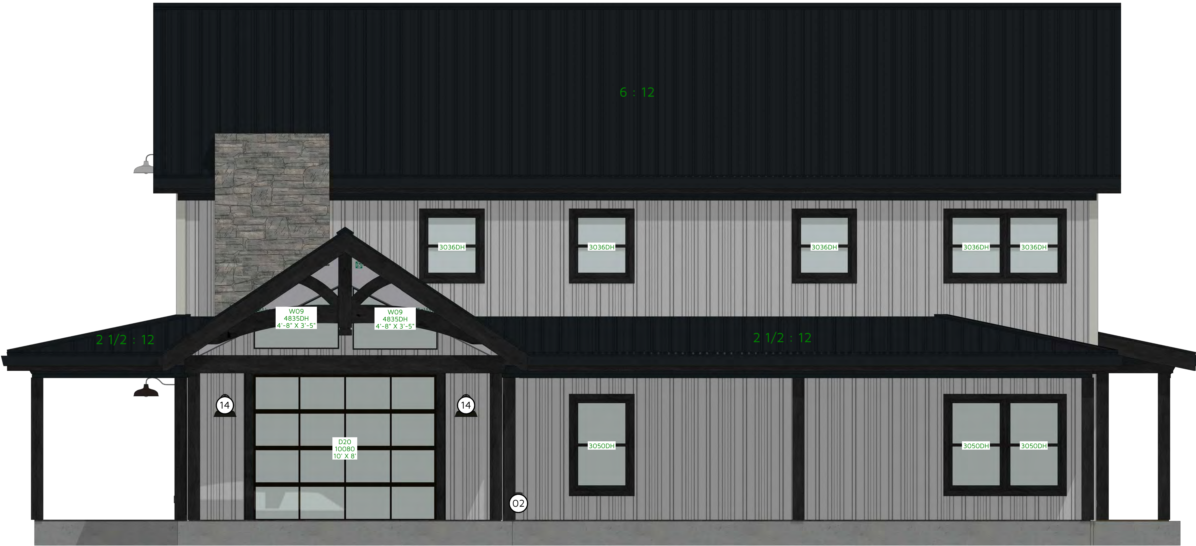
A-1 A-1 EXTERIOR ELEVATION FRONT 3/8 IN = 1 FT