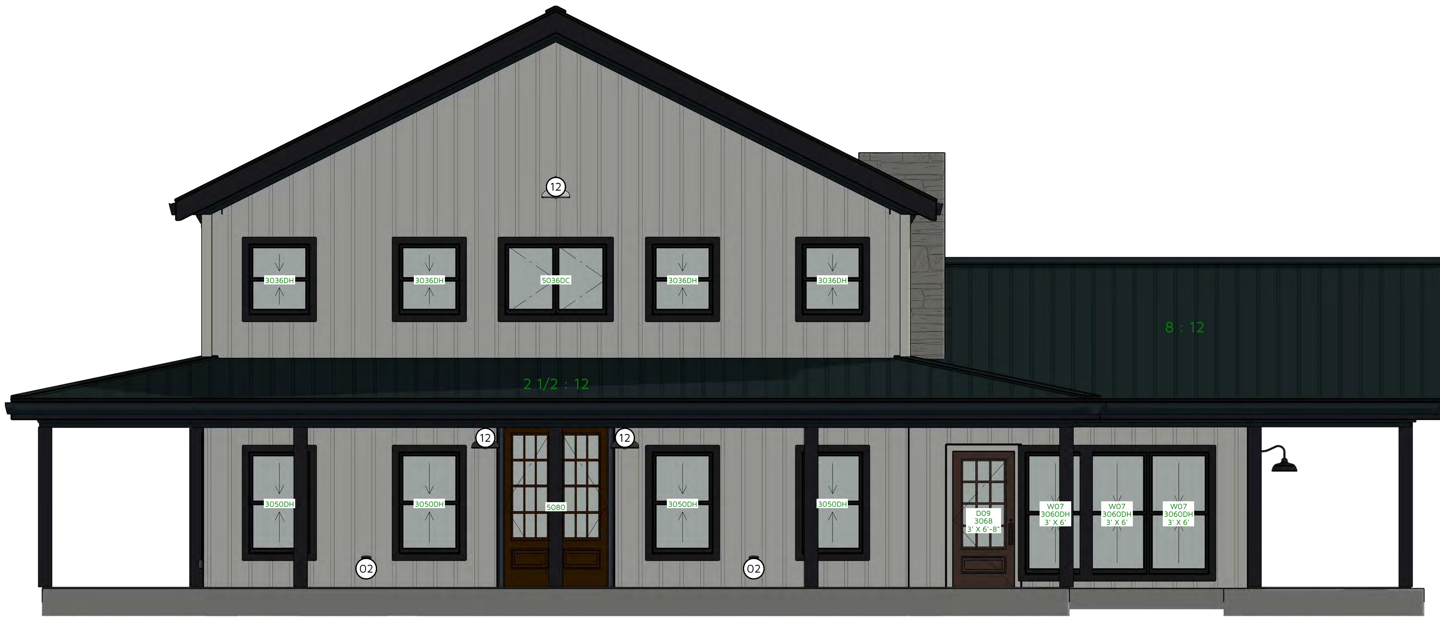
A-5 A-3 EXTERIOR ELEVATION LEFT 3/8 IN = 1 FT