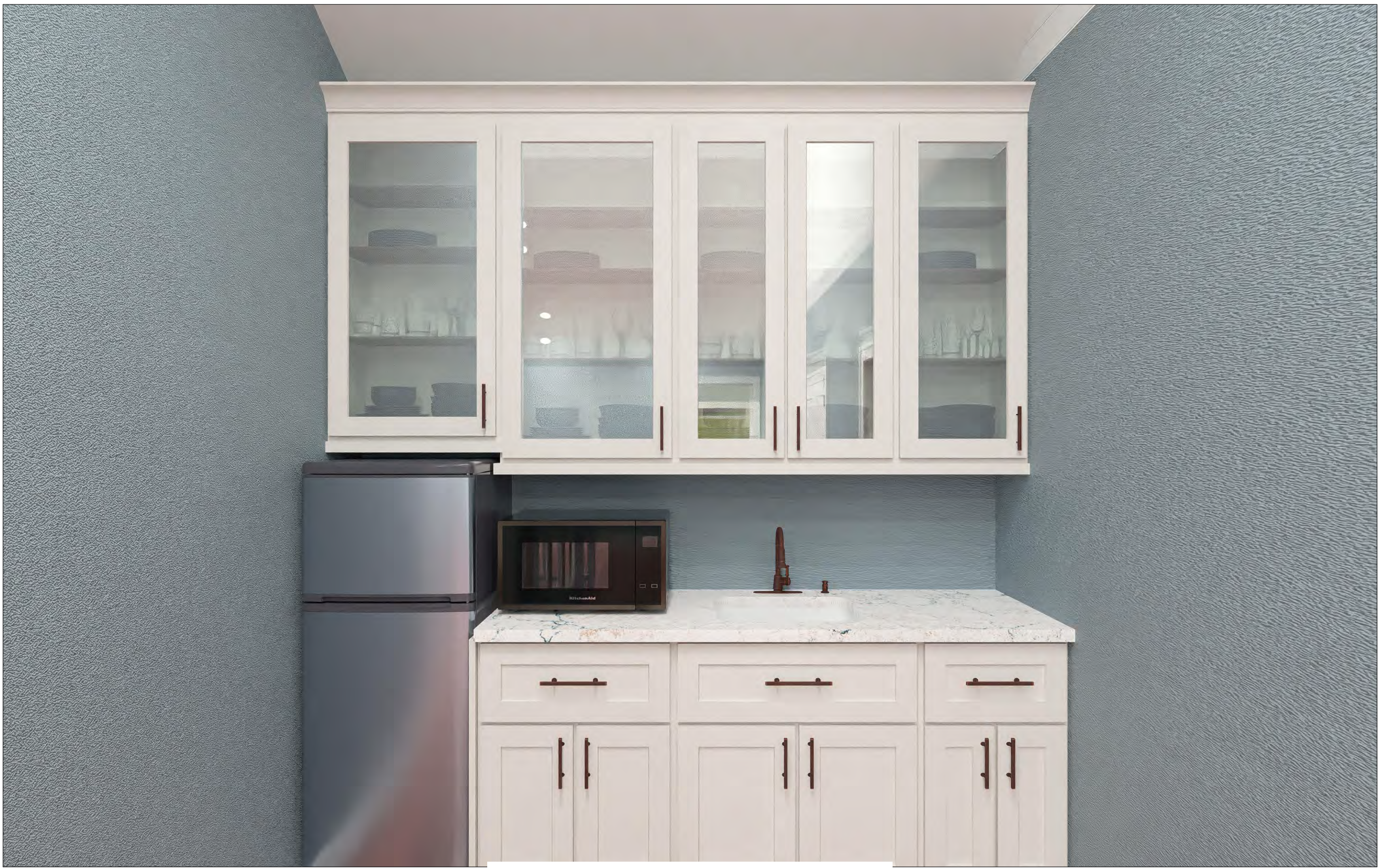
SECOND FLOOR KITCHENETTE