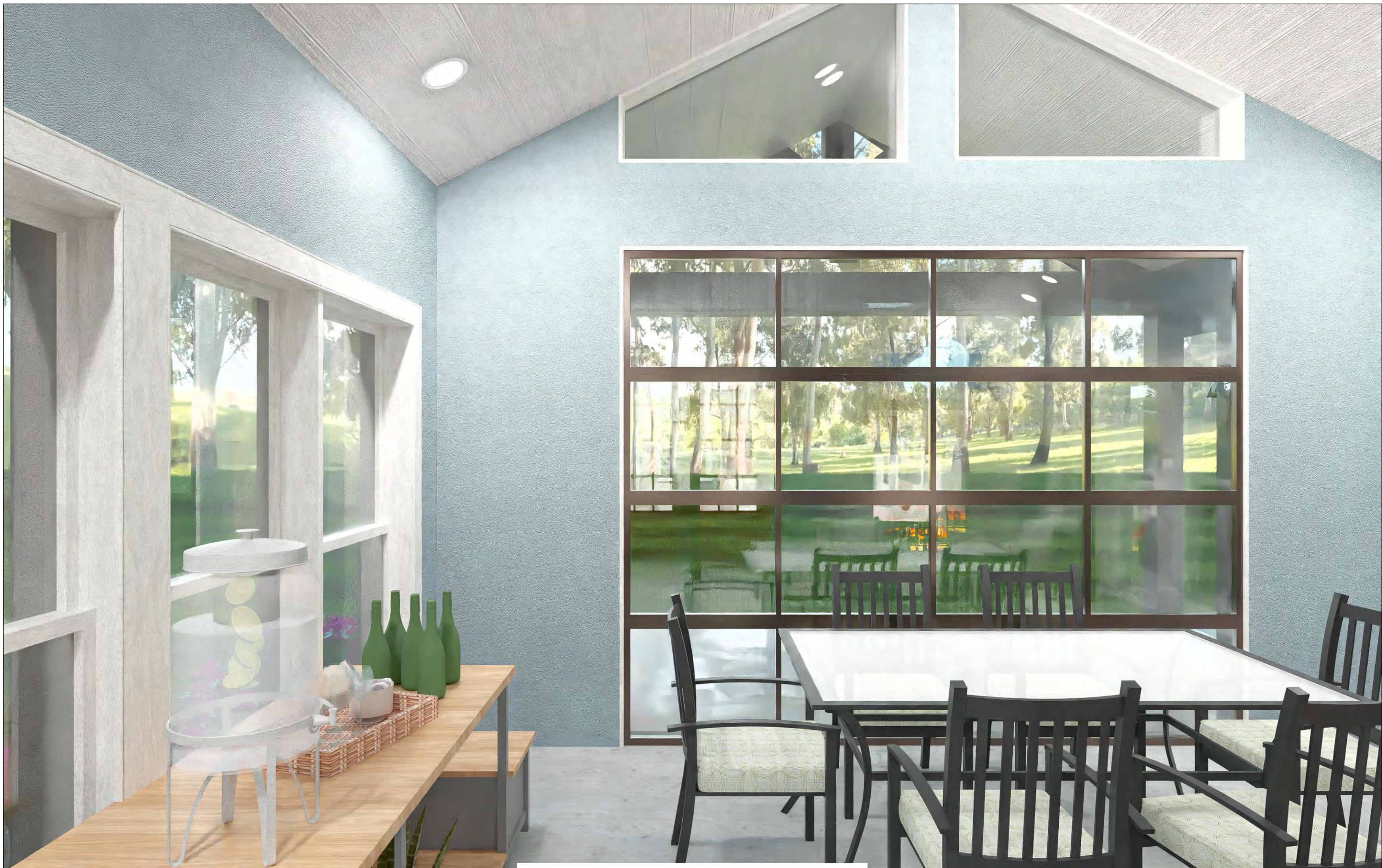
SUNROOM FRENCH DOOR