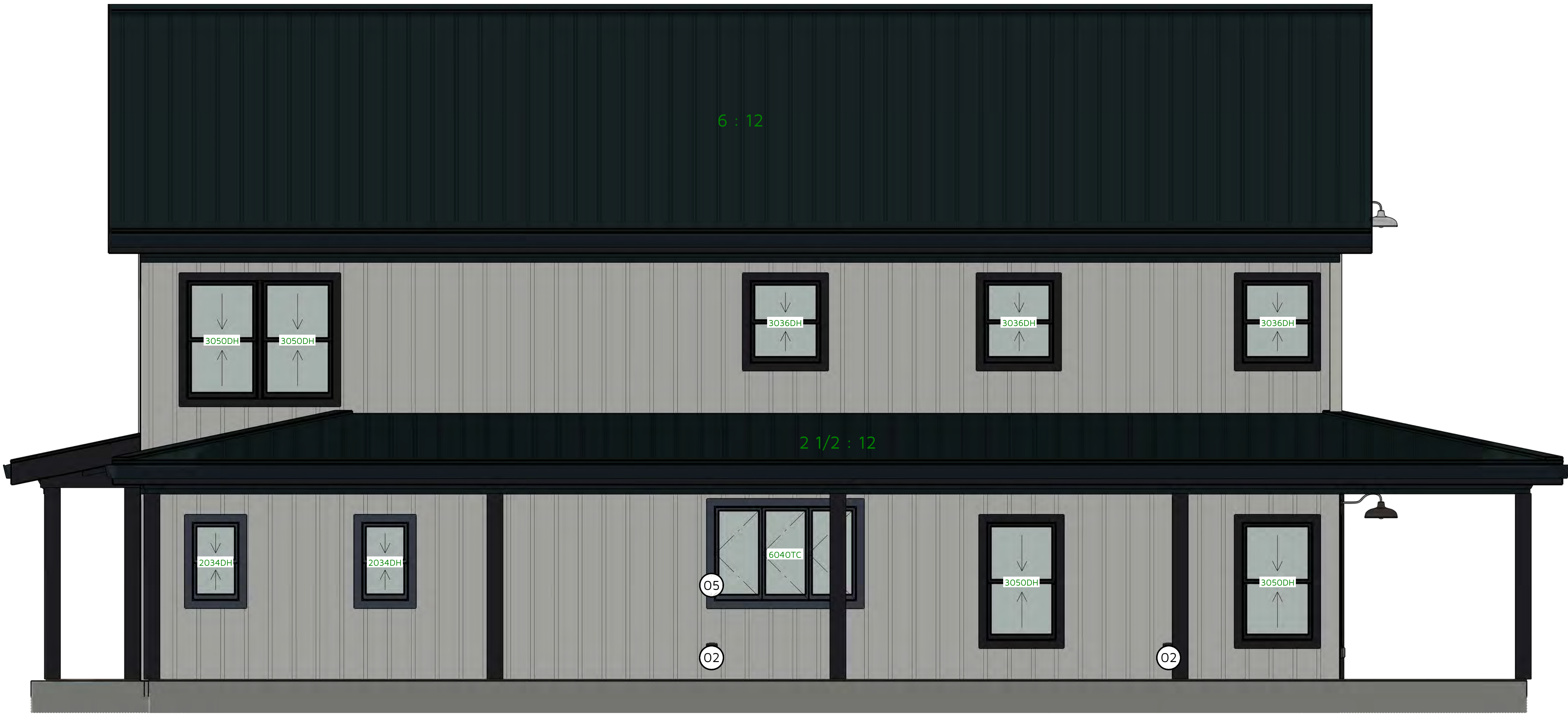
A-2 A-2 EXTERIOR ELEVATION REAR 3/8 IN = 1 FT