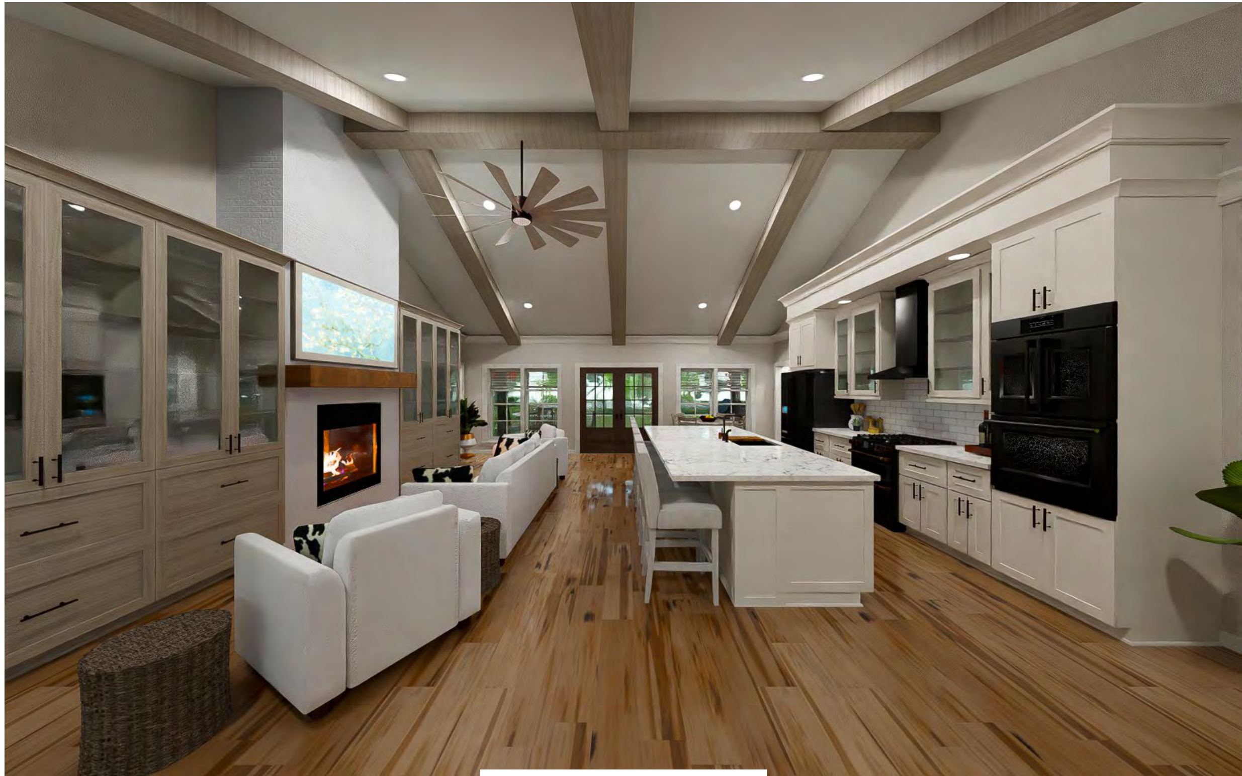
10 FRONT DOOR