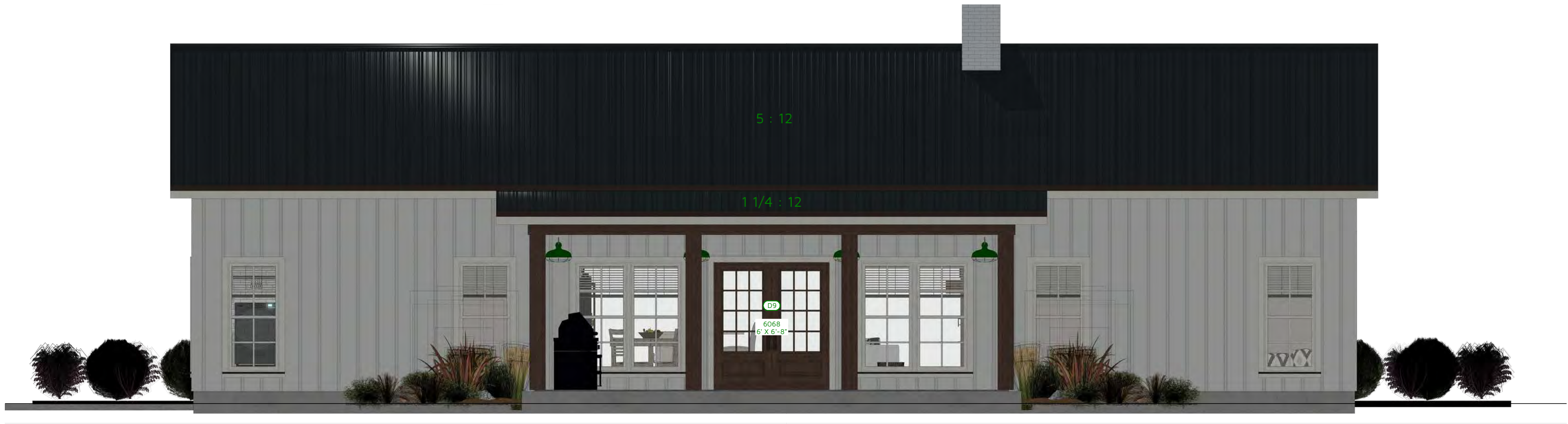
A-2 A-2 EXTERIOR ELEVATION REAR 1/4 IN = 1 FT