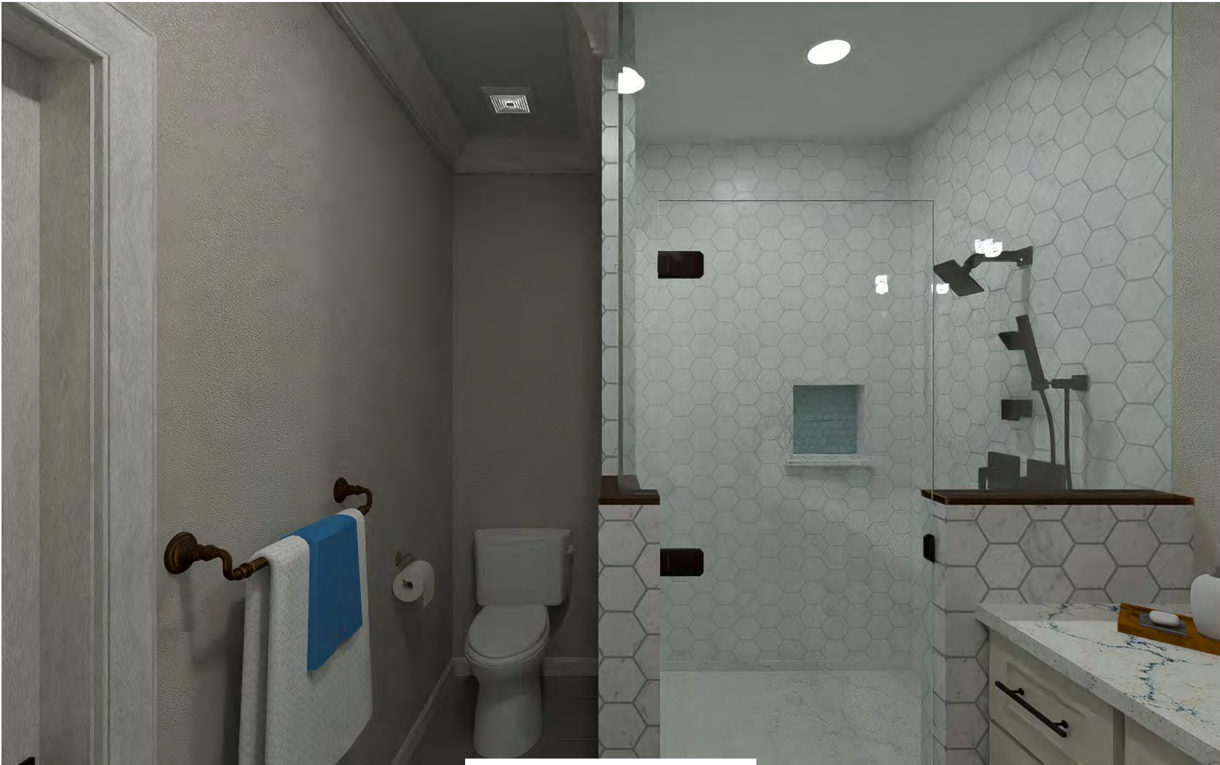
15 MASTER BATH