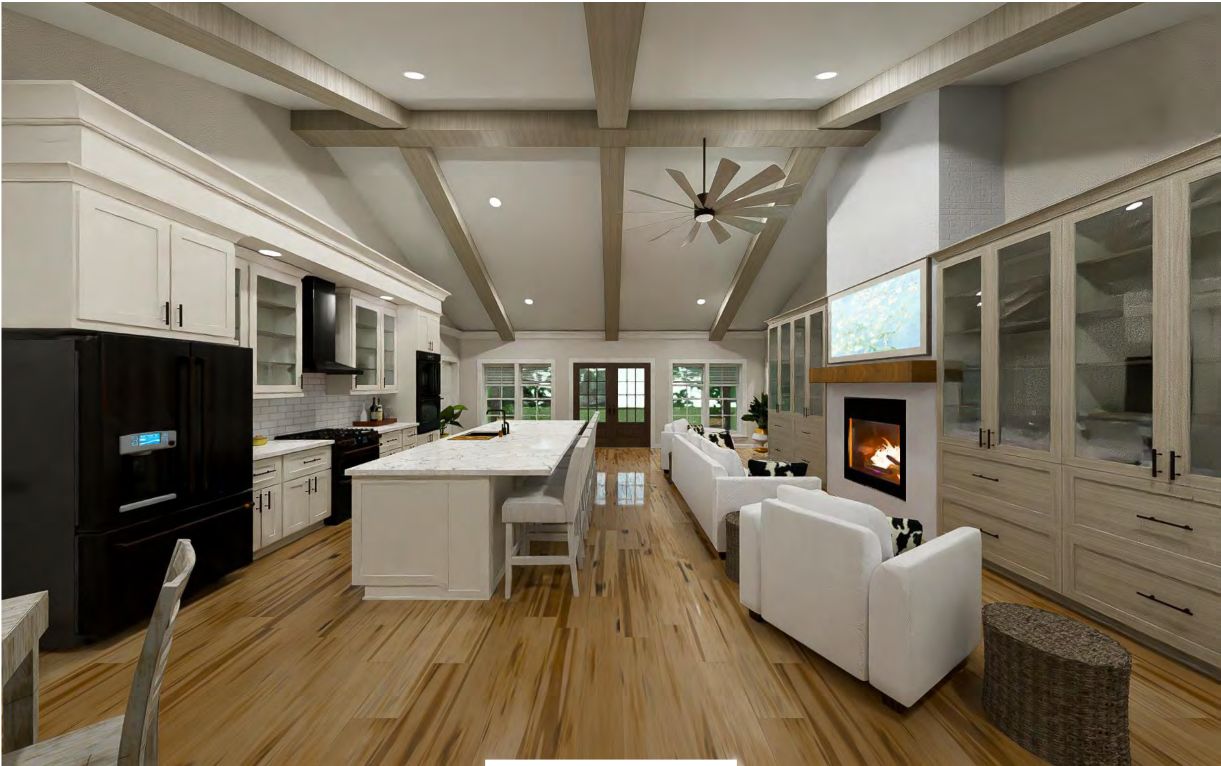
11 REAR DOOR