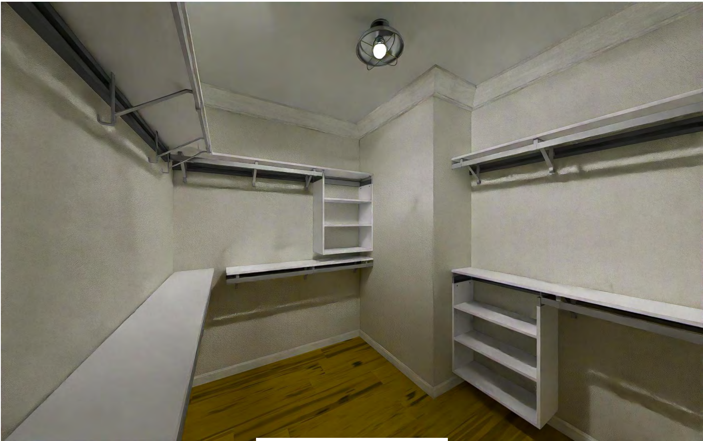
21 MASTER CLOSET