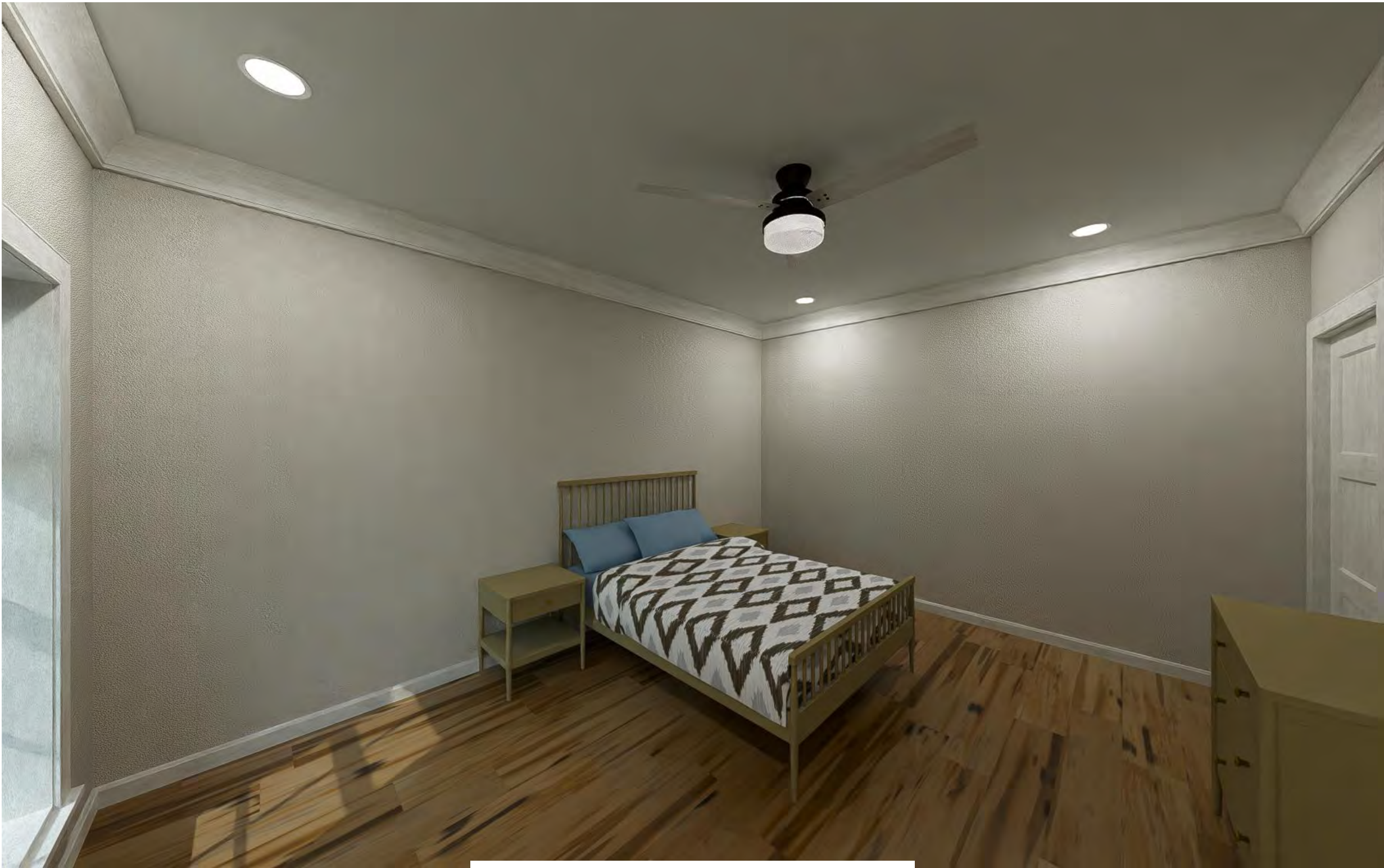
18 COMMON BEDROOM