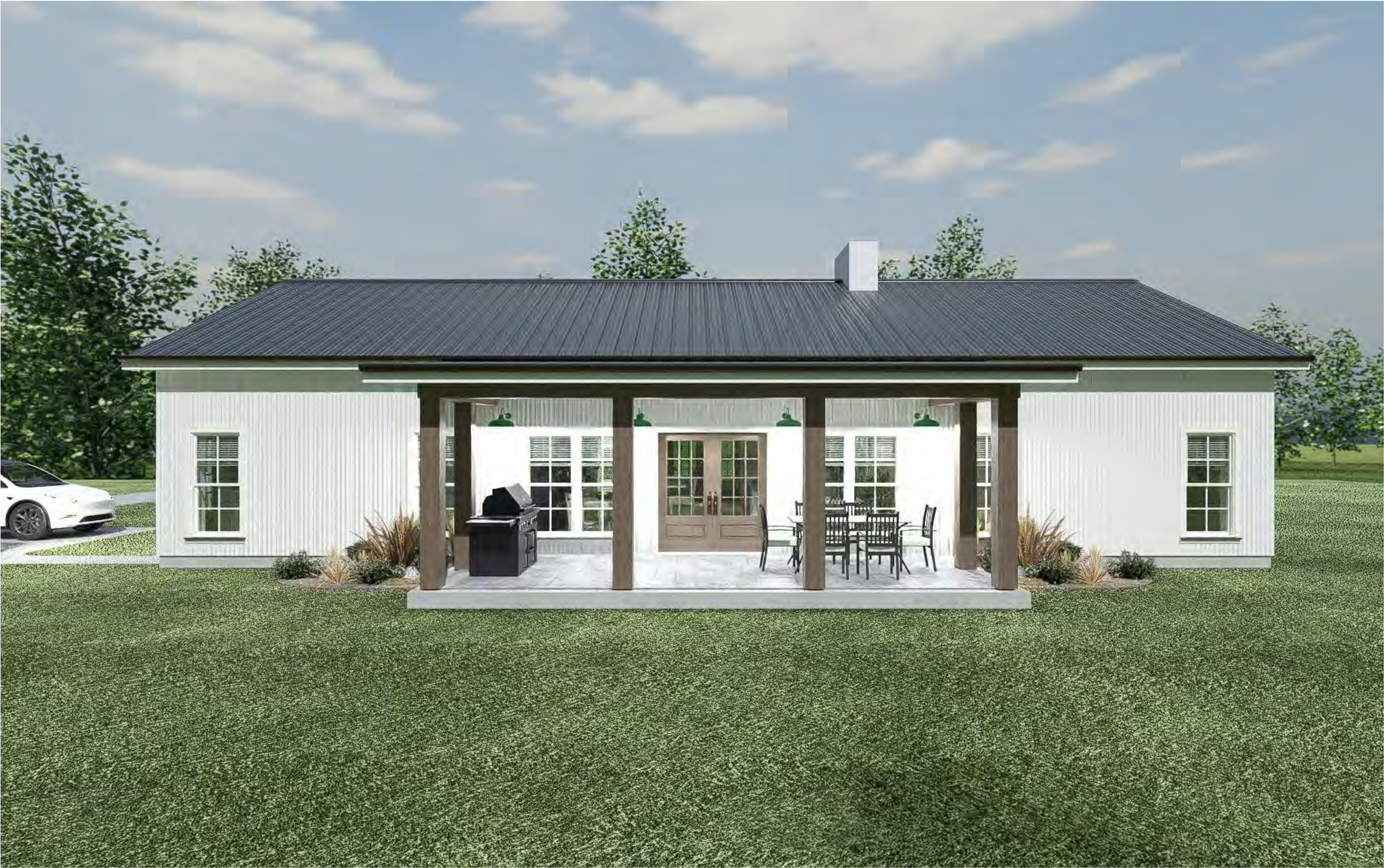
EXTERIOR 3D RENDERINGS - REAR ELEVATION