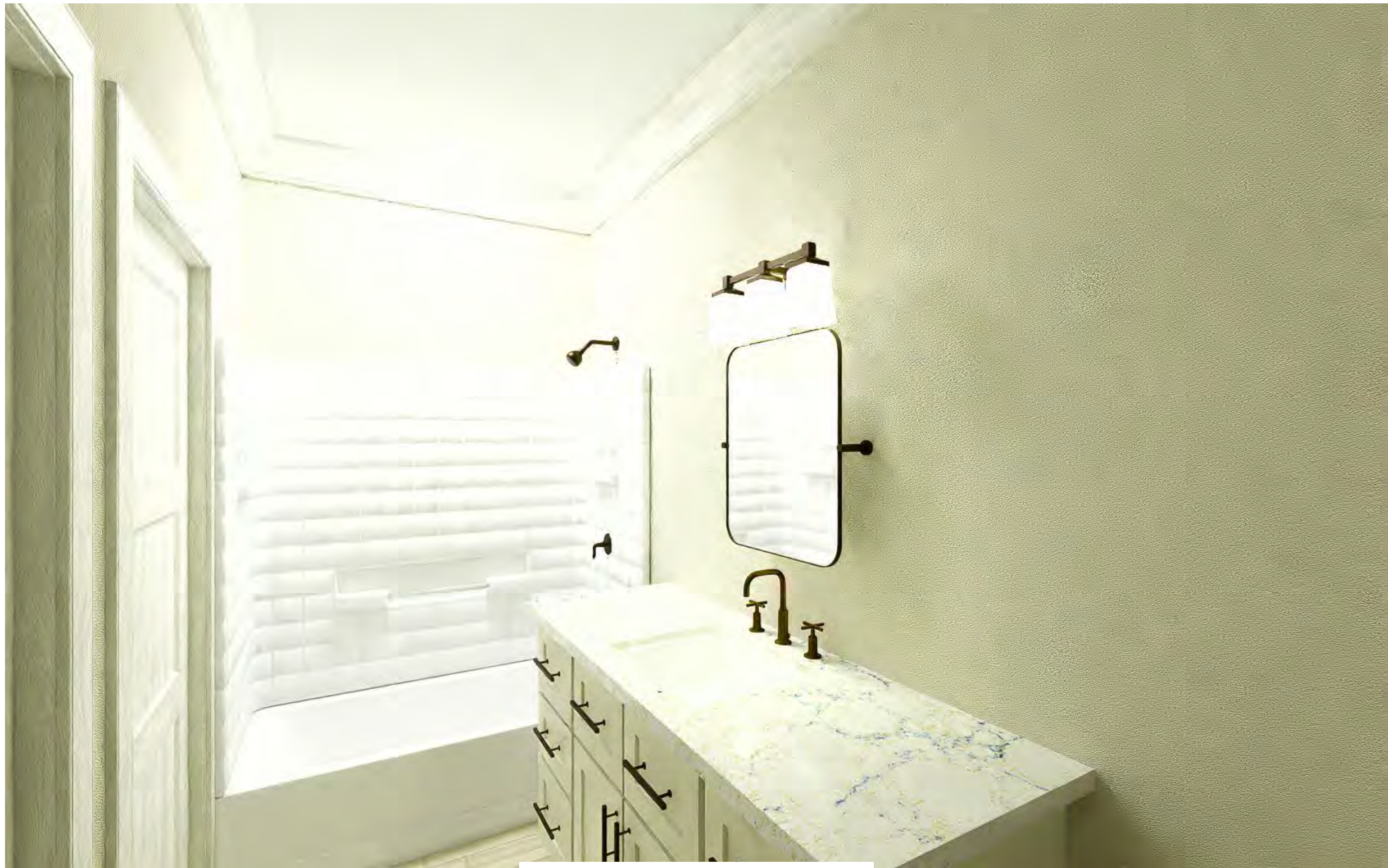
19 BATH COMMON