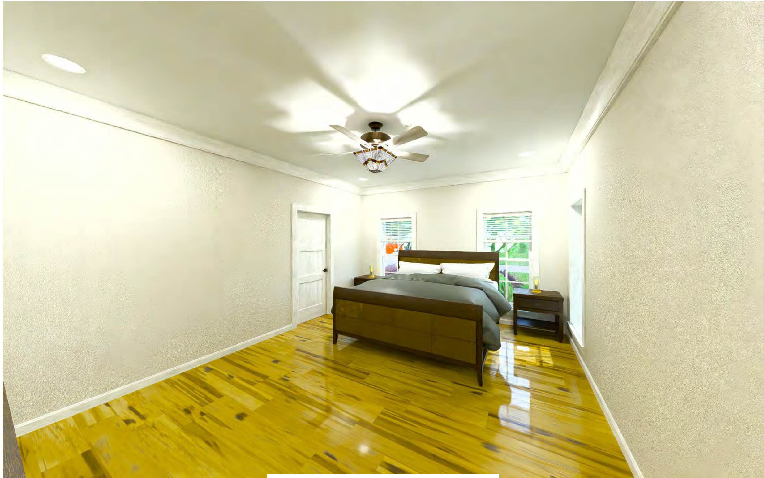
14 MASTER BEDROOM