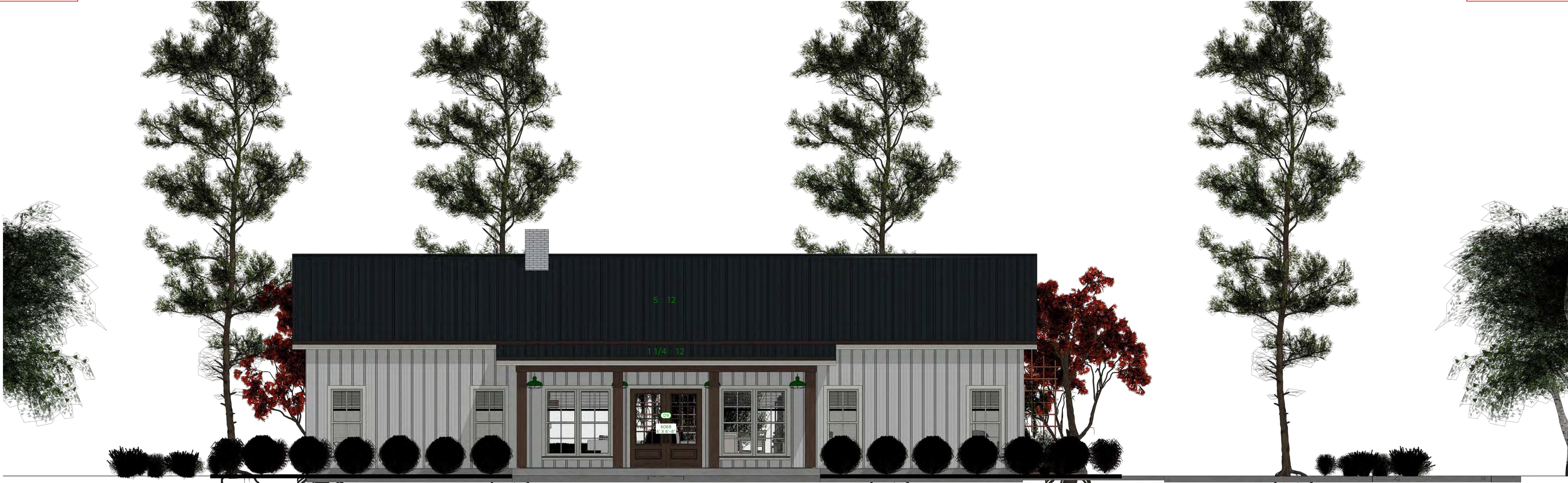
A-1 A-1 EXTERIOR ELEVATION FRONT 1/4 IN = 1 FT