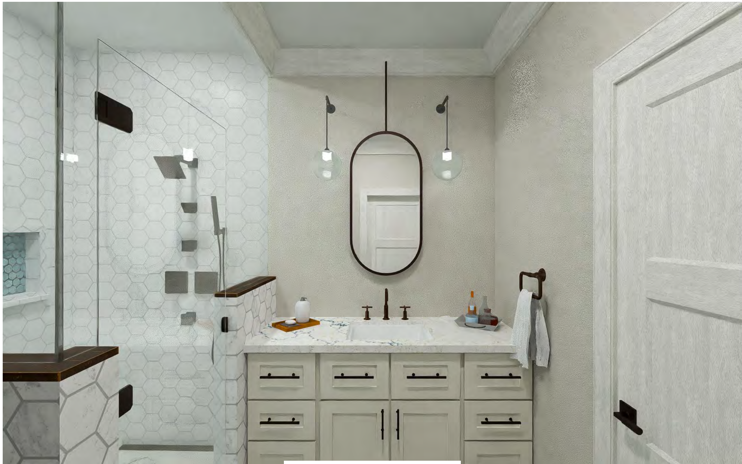
16 MASTER BATH