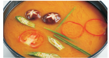
F 冬阴功汤 Tom Yum Soup (v)

02 第二步：选择您喜欢的涮品 Step 2: Choose Your Favourite Items