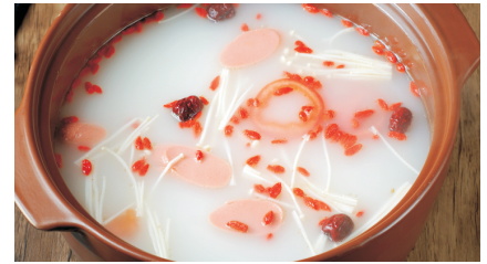
C 三鲜滋补汤 Three Fresh Nourishing Soup (v)