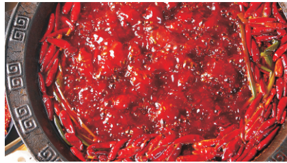
B 麻辣清油 Classic Spicy Broth (v)