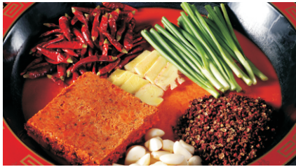
A 麻辣牛油 Spicy Beef Butter Broth

01 第一步：选择你您喜欢的锅底 Step 1: Order Your Favourite Pot