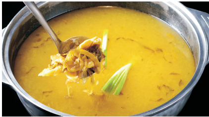
E 老坛酸菜 Traditional Sichuan Pickles & Cabbage Broth (v)