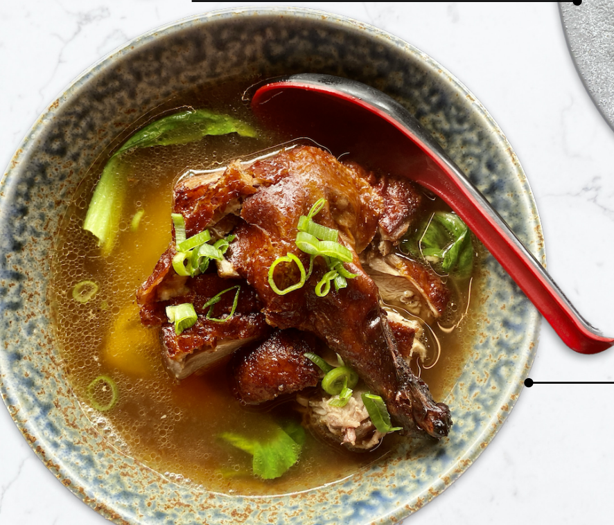
Roast Duck Noodles Soup £12.8