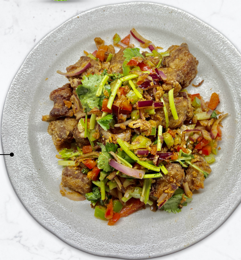
Spicy Cumin Lamb £16.8