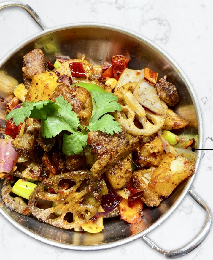
Dry-Wok Lamb with Lotus Root and Potato £16.8