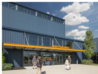
Mason 990 Reading Rd, Mason OH 45040 (