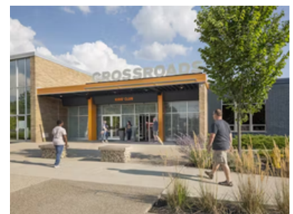
West Side 8575 Bridgetown Rd, Cleves OH 45002

Cards are NOT available at Crossroads Uptown.