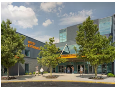
3500 Madison Rd, Cincinnati OH 45209