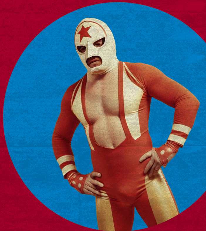
PICTURED: Nikolai "The Ural Avalanche" Fedorov, the current MCW World Heavyweight Title holder.

A WORD FROM THE US DEPARTMENT OF WRESTLING