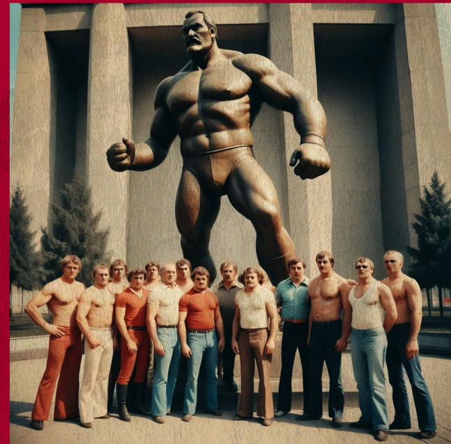
PICTURED: A group of proud citizens gathered around the famous Monument to Soviet Squared Circle Strength, inspired by its message of solidarity and power.