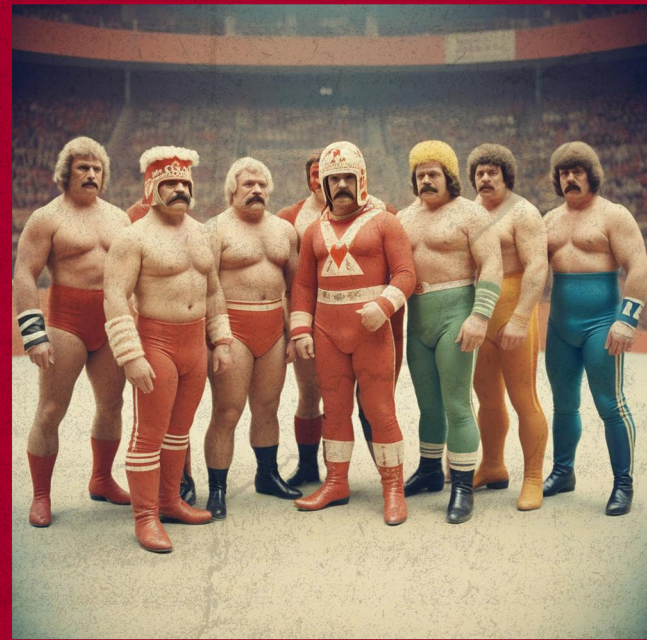
PICTURED: Just some of the many superstars working with the MCW for the glory of the Soviet people.