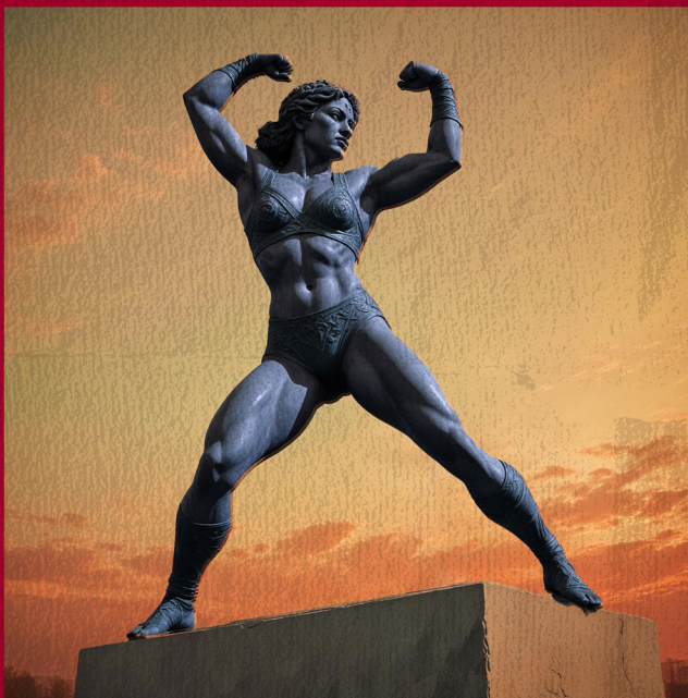
PICTURED: Monument to Proletarian Wrestling Glory Kitay-gorod, ca. 1937