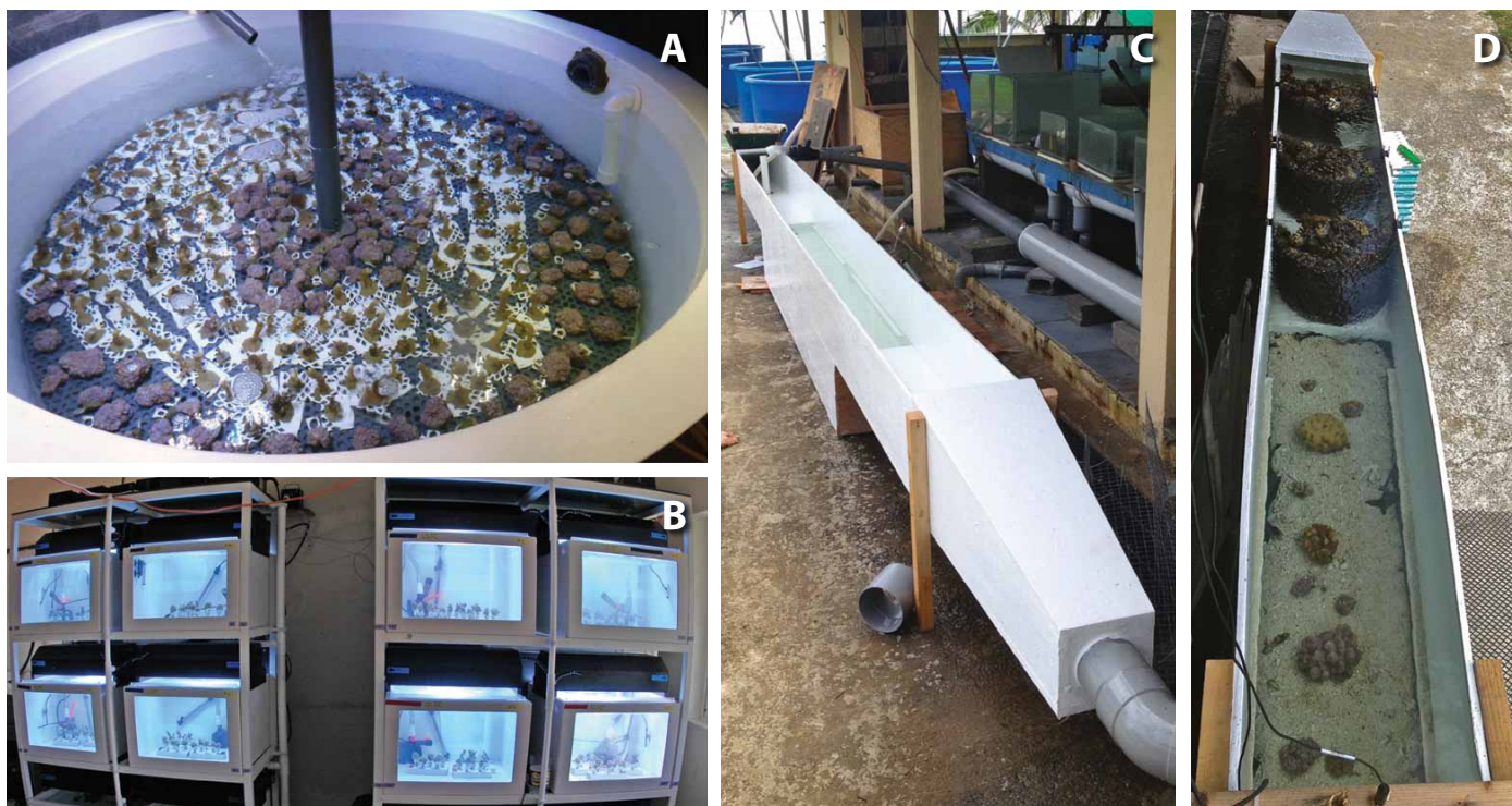
Figure 1. The effects of ocean acidification (OA) on corals and calcified algae in Moorea have so far been conducted in mesocosms, but outdoor experiments with the objective of eventually manipulating p\text{CO}_2 on the reef are in early stages. (A) Following collection, corals and algae are acclimated in a tank where light and temperature are controlled. (B) When acclimated, they are placed in mesocosms in which light, temperature, and p\text{CO}_2 are regulated. (C, D) Future experiments will be conducted in 5 m long flumes that receive \text{CO}_2 -manipulated seawater under natural sunlight.

et al., 2010). However, they also support conclusions that are nuanced compared to other studies, and provide some optimism for the future of coral reefs.