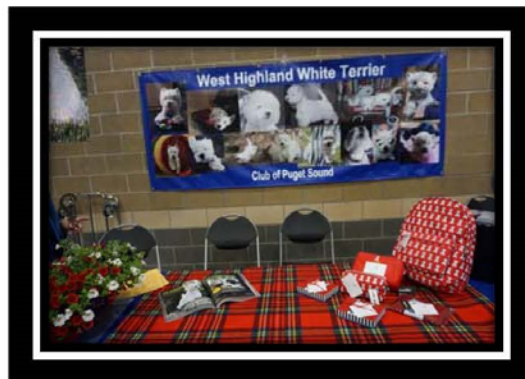
Westie Table set up and ready for the day's Show