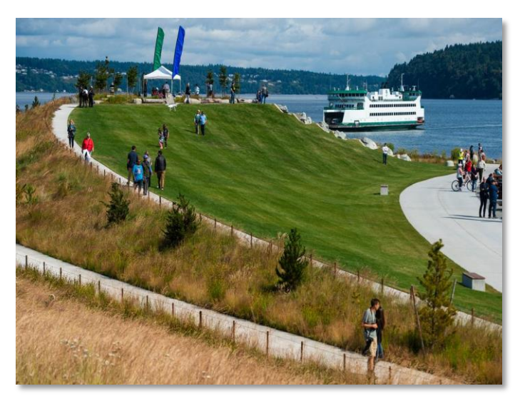
What a renewed and spectacular space for all of us – we'll be back!