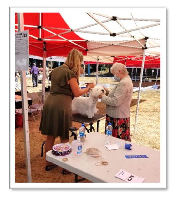
Terriers competing for Best of Show at the August 19th All Terrier Club Dog Show