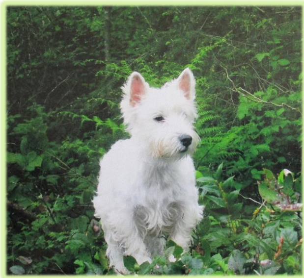
McDuff, age 2