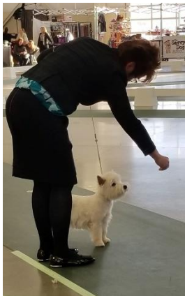
Bailey in the ring