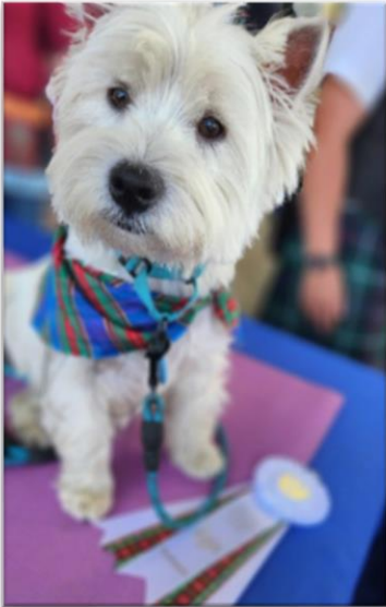
Brody at the PNW Highland Games

There's a lot to catch up on since the last newsletter. We held three Westie Walks (Tacoma, Edmonds, Des Moines), a record number. The last weekend in July, we sponsored a booth for two days at the Celtic Kennel at the Pacific Northwest Highland Games.