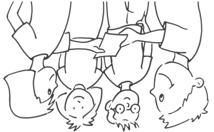
On Monday he went into school and gave the invitations to his friends.