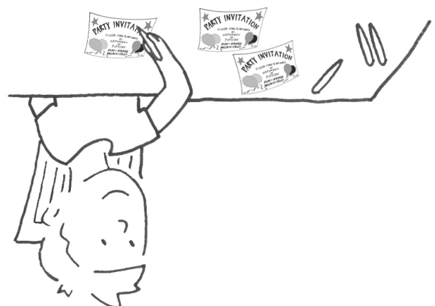
On Sunday he wrote his party invitations

How to make: Fold along all lines, Cut along dashed line Fold the page lengthways Pull out the two central folds and place in order to make a flip up book.