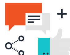
social media & reputation management