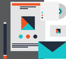
branding & audience development