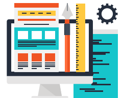
SEO & website development