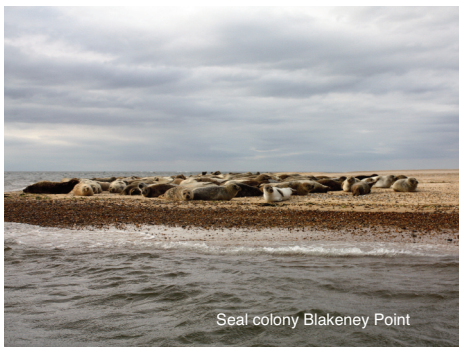
Seal colony Blakeney Point

Norfolk is blessed with a wealth of great campsites. Here are some we think you should find out more about.