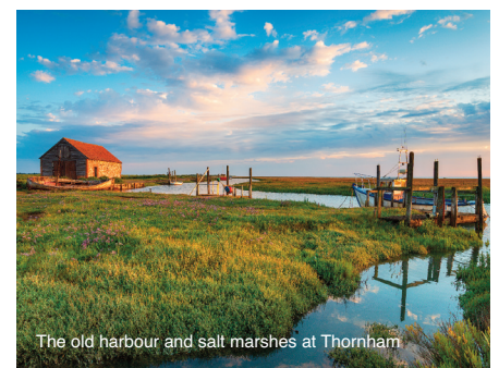
The old harbour and salt marshes at Thornham