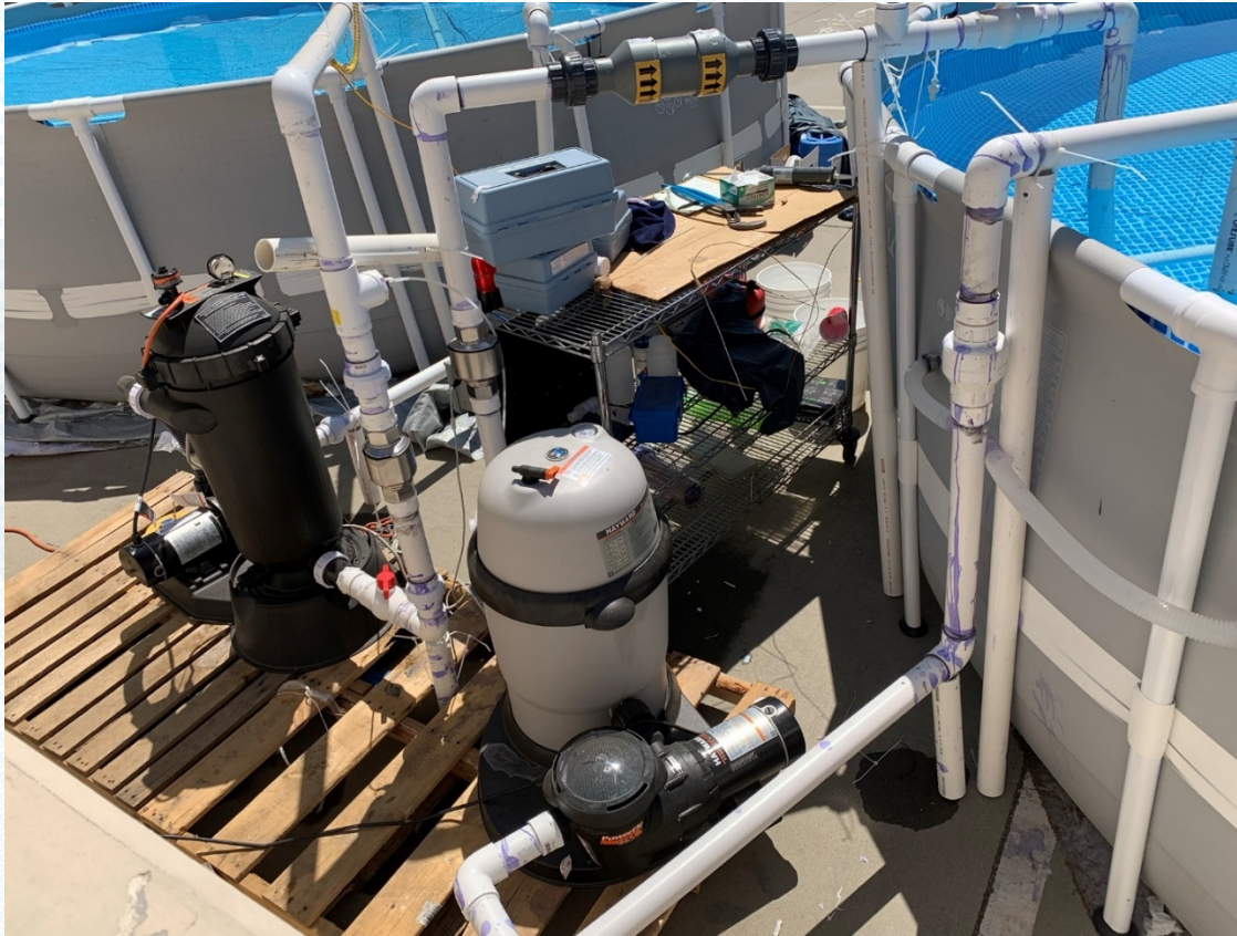
Figure 2- Device Under Test