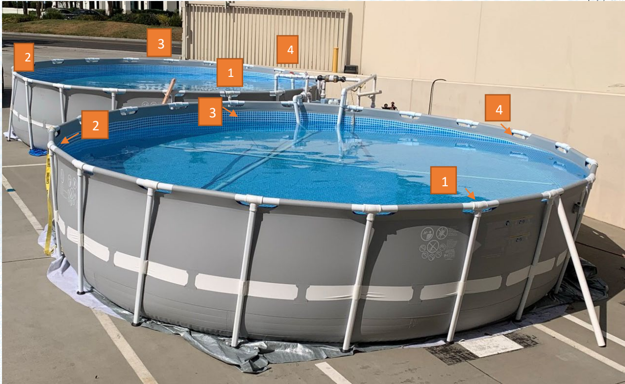
Figure 1 – Two Pools Layout