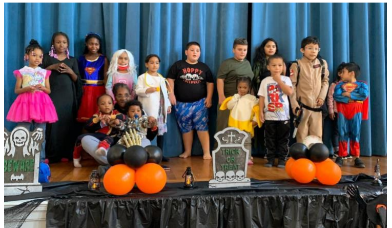
Halloween '22: Party at Snyder Academy