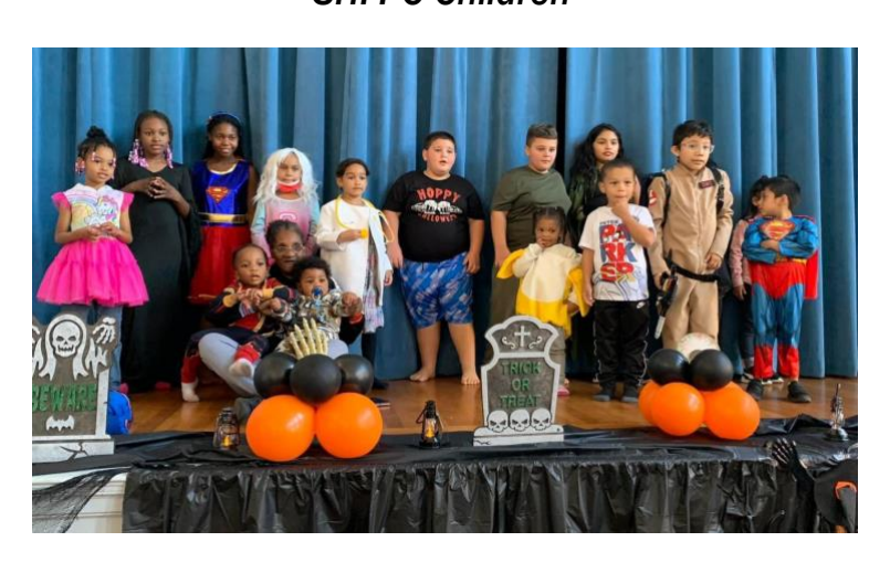
Halloween '22: Party at Snyder Academy