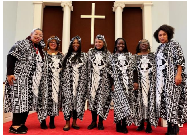
23 Oct '22: Stewardship Sunday