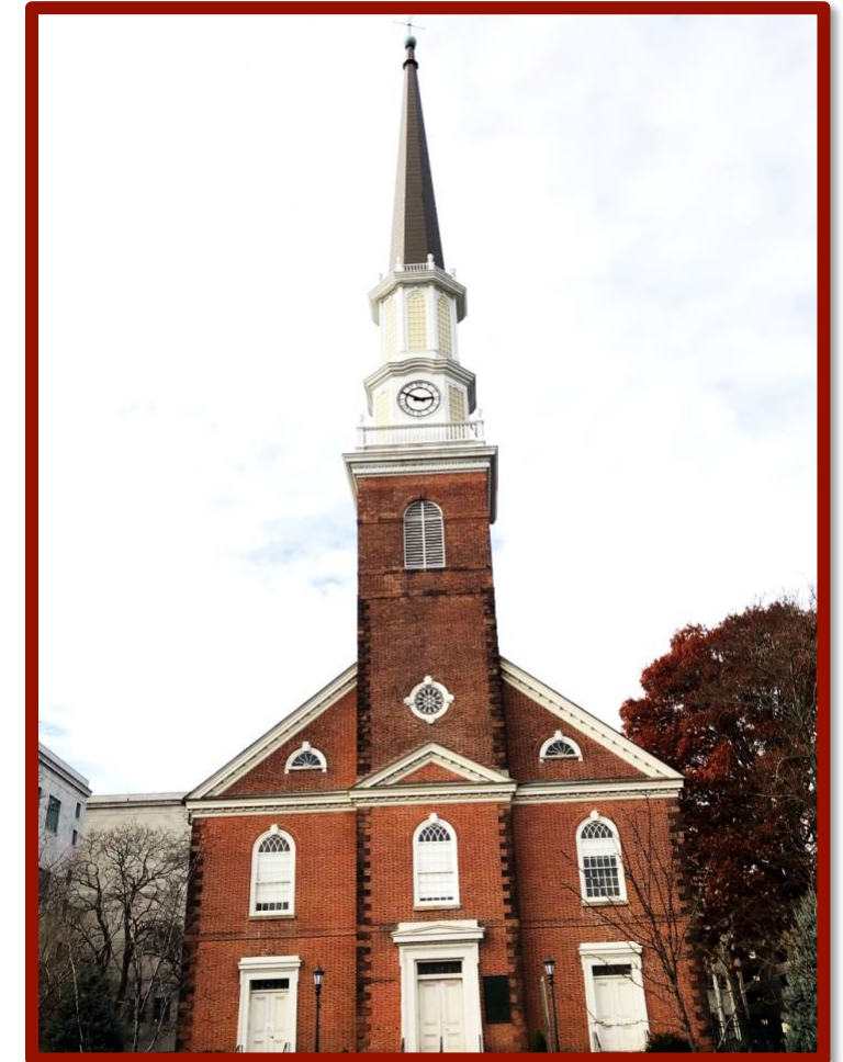
Founded as the First NJ Christian Congregation in 1664