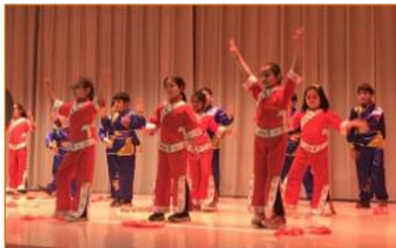
Another successful CASA residency at PS 69 concluded with a celebratory performance of traditional Chinese and Korean dances. Thank you, Flushing Town Hall teaching artists.

In January and February, spirit days, holidays, celebrations of and events announcements showcased PS 69 students' talents, continued building their academic and personal skills, brought joy to and further strengthened the bonds of our school community.