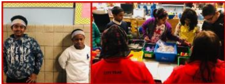
These students used their hawk bucks to purchase some cool school gear. PBIS Store is in session led by our City Year team