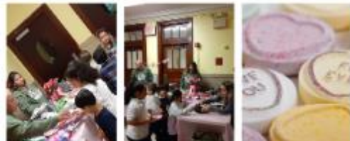
PS148Q PTA Valentines Boutique

P.S. 148 celebrated the 90th anniversary of our school!