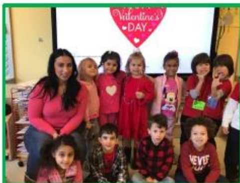
Cupid Struck 397! We are celebrating love, happiness and kindness!