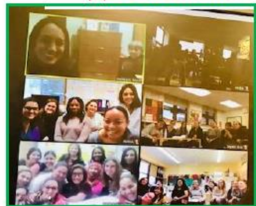
Together is better...together as one is how District 30 Pre-K learns through professional learning zoom conference.