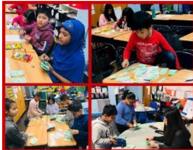
Students counting their hawk bucks to purchase items at the PBIS Store