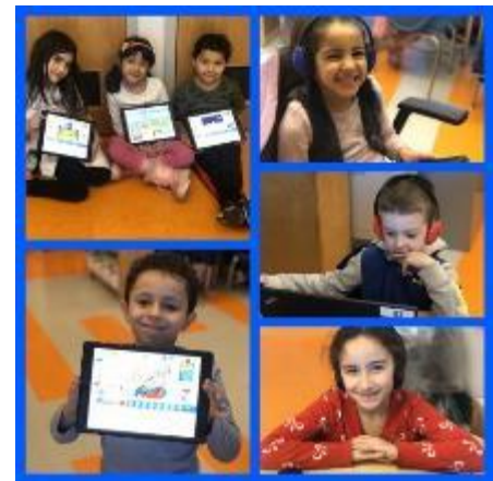
K-S scholars code and create with Scratch Jr.