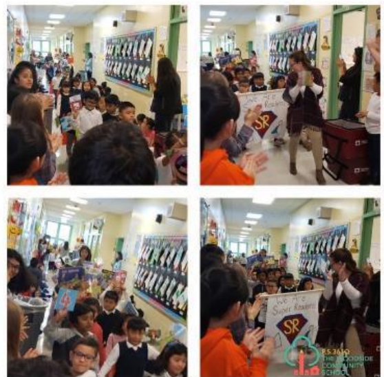
Our Kindergarten "We Are Super Readers" parade was a fun event for our youngest readers! Our older students cheered them on in celebration.