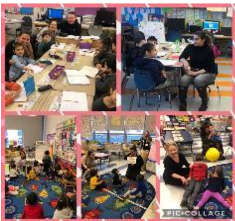
1 st Friday of every month parents join us as Parents as Learning Partners