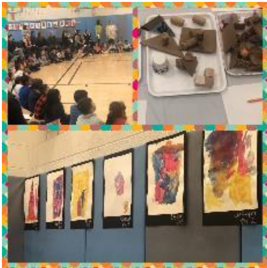
Pre-K families enjoy a special event, "Where We Live" showcase in collaboration with Studio in a School