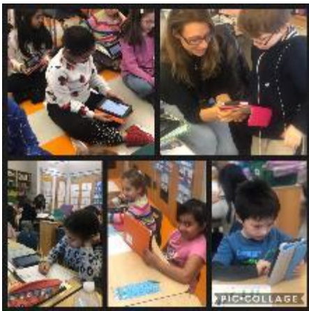
2 nd Grade using Snapet Tablets during math instruction.