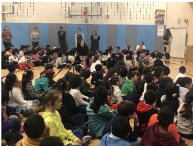
The midyear PBIS Assembly was fun for all! A mix of chanting, #Jeopardy and #teamwork made for a good refresher of #PBIS!, #PS361Q, #January, #positive behaviors