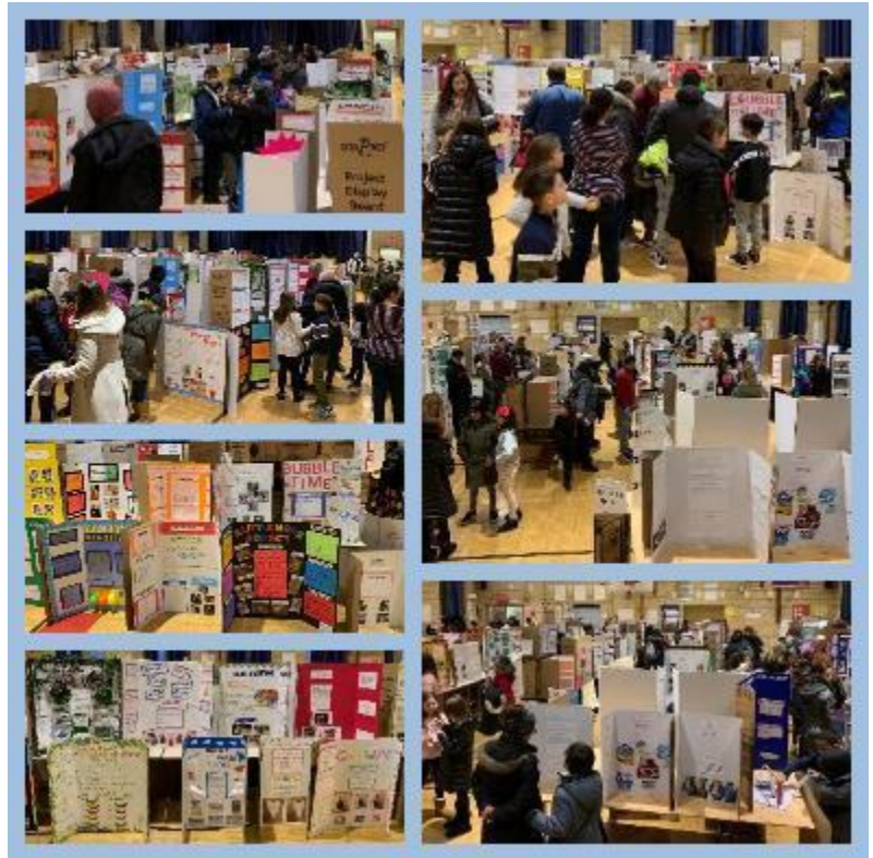
February 5, 2020 Science Fair