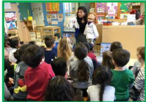
At 78, we are showing our thankful smiles to Dental Smiles 4 Kids who came and taught us all about dental hygiene.