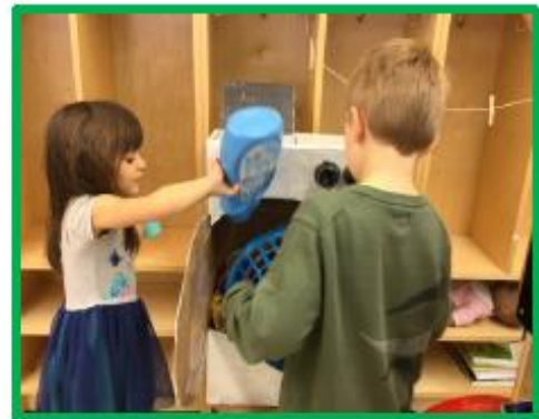
At the TCU, students turned their dramatic play center into a laundromat!