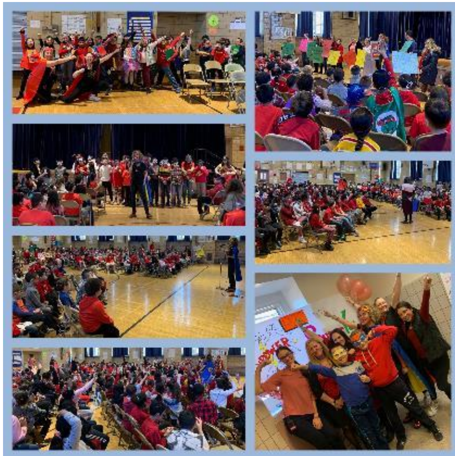
Respect for All Assembly February 14, 2020