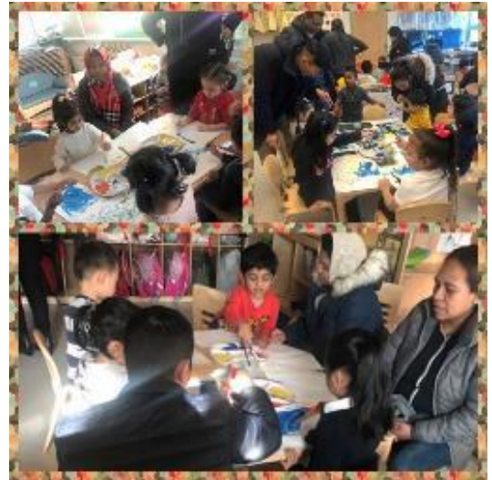
Pre-K Celebration of Light unit including creating their own Starry Night paintings! Students made choices about brush types, colors and techniques they would use for their paintings. What a fun way to end a unit.