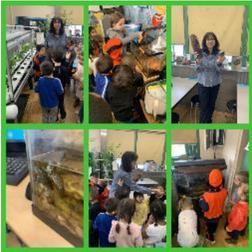
Hands on Science Hydroponics, pine cones, turtles & more