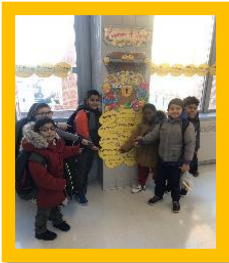
Wordsmiths are always on the lookout for the "Word of the Week"