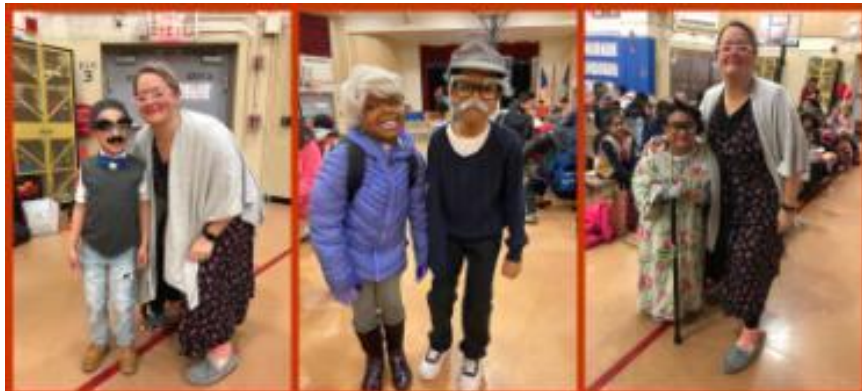
100 Days of School