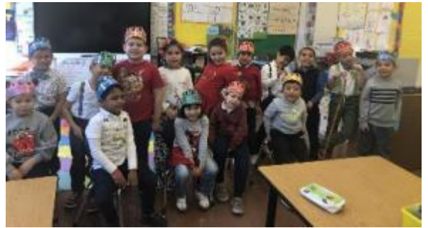
PS 148Q 100TH DAY OF SCHOOL