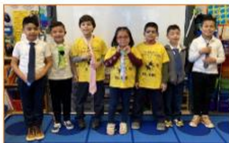
PS 69 students were well dressed in their Crazy Hats and Ugly Ties for school spirit days.