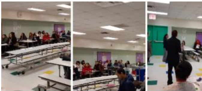
PARENT ATTENDANCE WORKSHOP