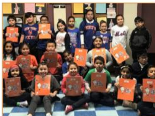
PS 69 students are once again ready to take on the Mets You Gotta Read! challenge.