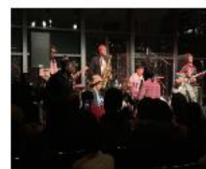
Lincoln Center PS 111Q Scholars and families enjoying the live band at the Lincoln Center