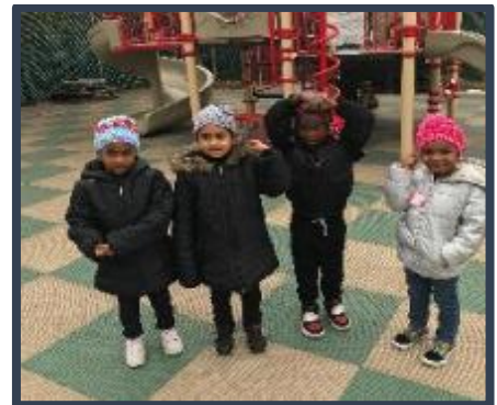
Thank you to Crochet for Kids for making and donating these beautiful warm hats to the students of the District 30 Pre-K Centers!