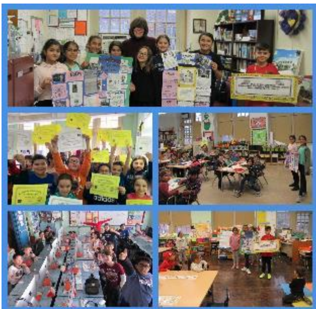
College and Career Day Assembly and classroom visits by NYPD, FDNY, Dept. Sanitation, MTA, USPS, an actress, a neurosurgeon, and much more.