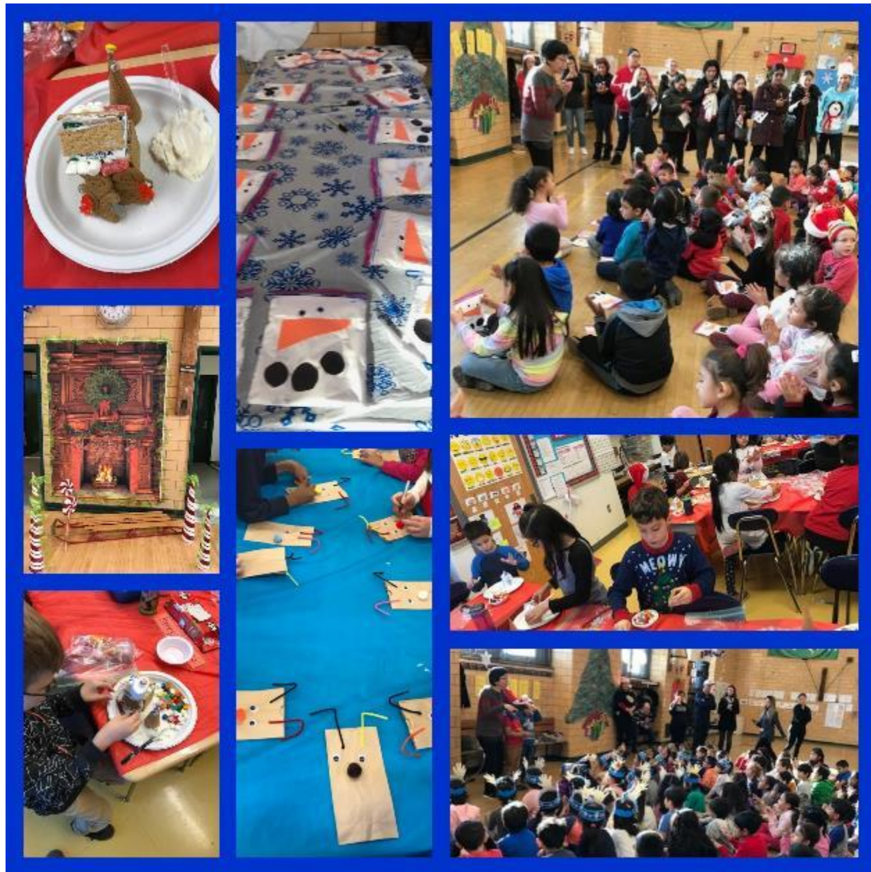
Children sat around listening and singing to holiday music. Pre-K to 2 nd grades did art projects, 2 nd grade made ginger bread houses.