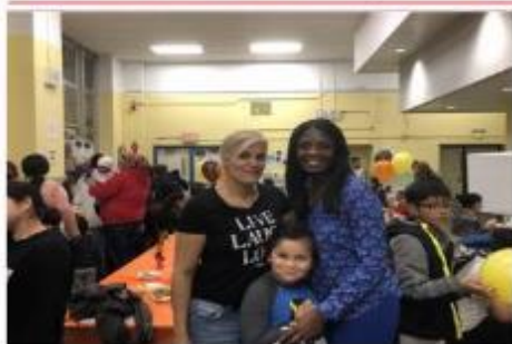
Community School 111Q had a Fall Festival Family Pot Luck in partnership with Voice Charter School. Families from both schools enjoyed an evening of good food, dancing and games.