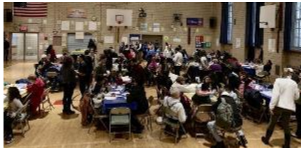
Family Fun! Families made snow globes, ornaments and candy dishes.