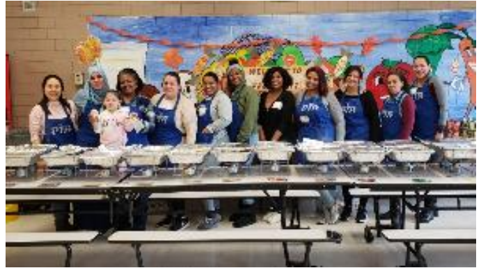
Volunteers at Thanksgiving Feast