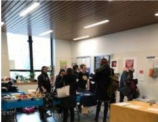
PTA selling P.S. 11 merchandise