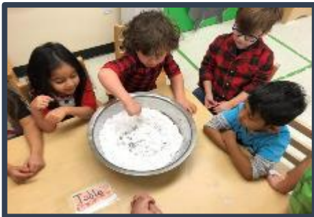
The students at the TCU are learning about Winter and making snow!