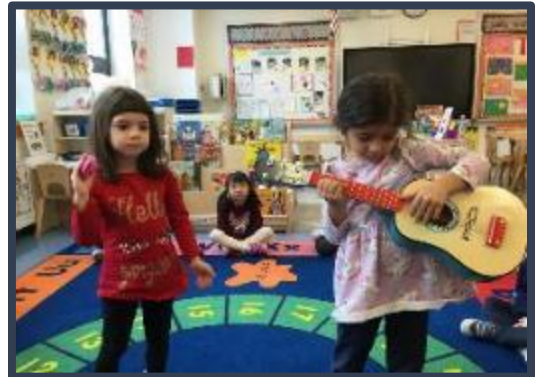
Students at 972 learned about flamenco and tango music!