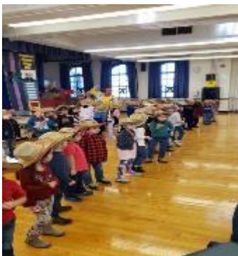
Kindergarten classes singing "You Got a Friend in Me"

We had a great time and so did our families and guests.