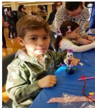
STEAM: Parents & Students Created Forky from Toy Story

Physical Education & our unit in yoga and continued yearlong practice in mindfulness