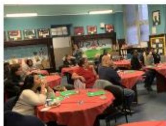
Principals Breakfast Families attending our bi monthly Principals Breakfast. In this forum families learned about NYC Kids Rise Save for College Program and the dangers of vaping and E-Cigarettes. Ending with an scraping Booking session that infused the importance of Literacy.